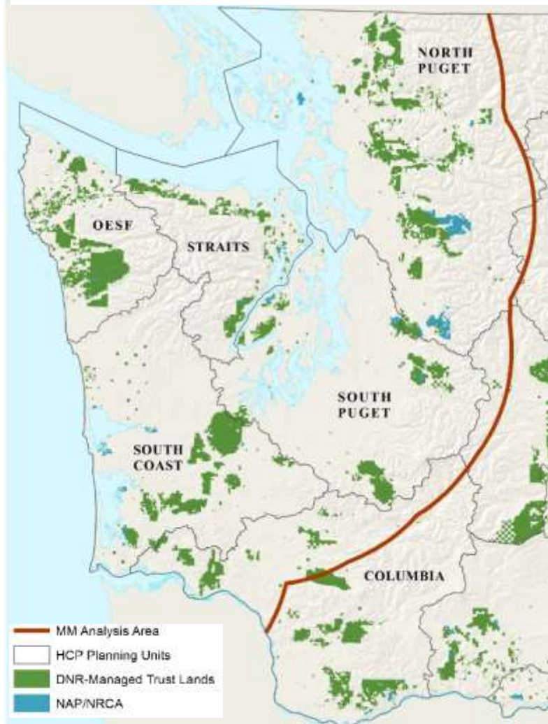
Figure 2. Analysis Area for the Analytical Framework

Not all of the lands owned and managed by DNR within the analysis area are marbled murrelet habitat. A key component of the analytical framework is defining what constitutes marbled murrelet habitat on DNR’s lands so that conservation strategies, impacts, and mitigation can be evaluated.