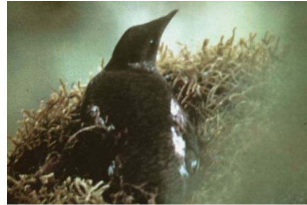
Marbled murrelet