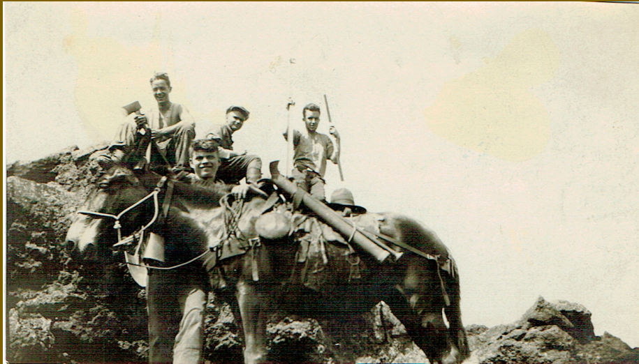
Top of Goat Butte