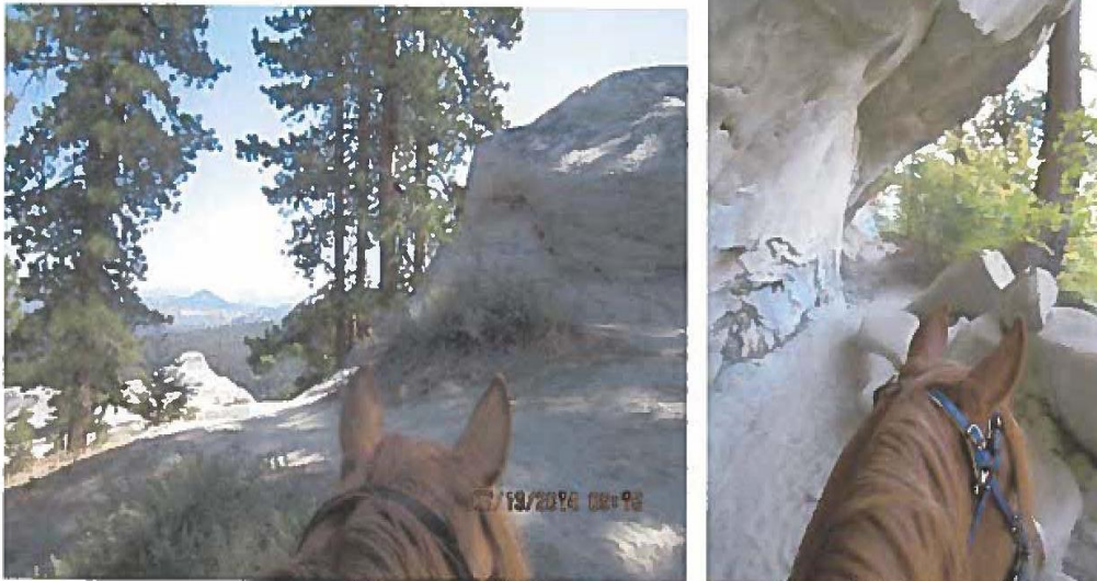
Figure 2. Photographs illustrating typical trail conditions in the lower Teanaway.

Cassandra Strickland cordilleranranch@gmail.com