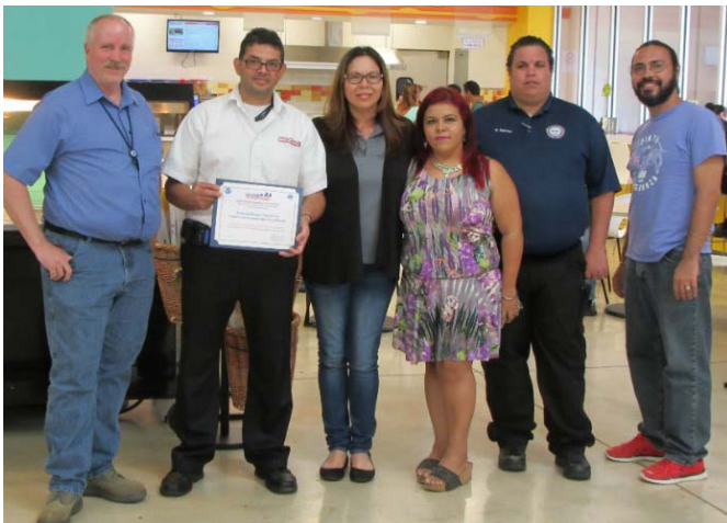
Supermercados Econo, Rincon, Puerto Rico