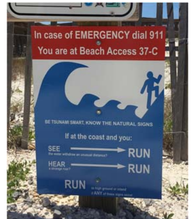
One of several coastal tsunami signs installed by Santa Rosa County. A sign was placed at each beach access point on Santa Rosa Island and Navarre Beach.