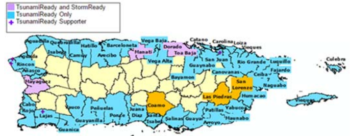
NOAA/NWS Official map illustrating the TsunamiReady communities in Puerto Rico, as well as the StormReady communities and TsunamiReady supporters ( http://www.tsunamiready.noaa.gov/communities.shtm ).

The commonwealth of Puerto Rico (PR) is under tsunami threat. The last significant tsunami to affect the island occurred in 1918 along the entire western coast of the island after an earthquake of ~7.3 magnitude with approximately 100 casualties. Nowadays, more than 249,000 people live in the tsunami prone zone, the entire coastal regions have a higher density of critical infrastructure, and the number of visitor is in the order of millions. Consequently, tsunami preparedness is key to local hazard mitigation and emergency management planning. Over the past decade (Mayagüez, was the first PR community recognized as TsunamiReady in 2006), local, state, and federal agencies (NOAA and FEMA), have worked together with the PRSN/UPRM (The Puerto Rico Seismic Network, of the University of Puerto Rico at Mayagüez, Geology) to improve the preparedness of Puerto Rico to tsunamis. This effort was funded by the NTHMP (National Tsunami Hazard Mitigation Program) in strong partnership with the San Juan National Weather Service Forecast Office (NWS/San Juan) and the Caribbean Tsunami