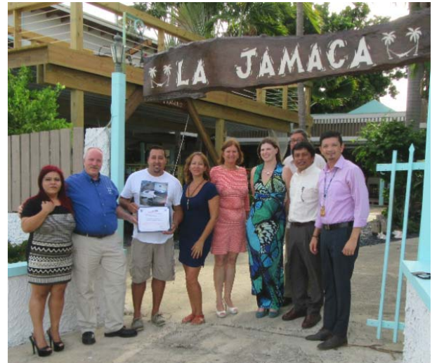
Estancia La Jamaca, La Parguera, Puerto Rico

The NWS Warning Coordination Meteorologist has the single sign-off on the TsunamiReady Supporter Program -- not the state TsunamiReady Board (or equivalent).