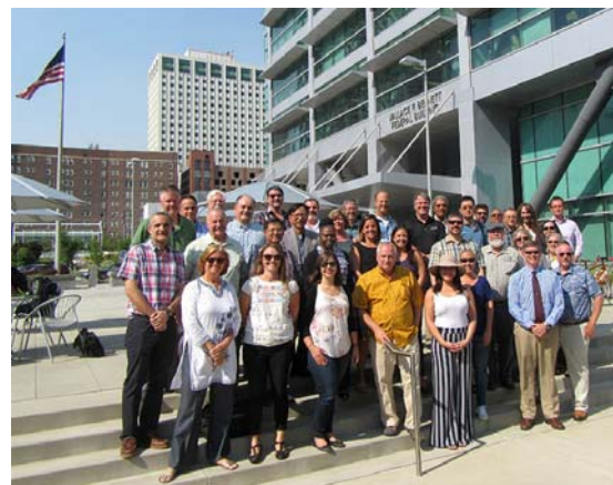
Attendees of the NTHMP 2017 Summer Meeting in Salt Lake City, Utah.