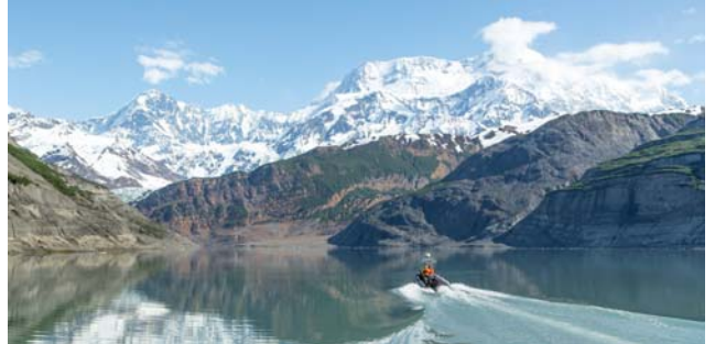
A skid driving into Taan Fiord, Alaska.

Six-hundred-foot waves crashed down on the coasts of Taan Fiord, Alaska after a massive landslide sent over 100-million tons of rocks into the water on October 17, 2015. A group of investigators, including Patrick Lynett from the USC Tsunami Research Center, conclude that the event was caused by rapid glacier retreat, an indirect effect of climate change that is increasing natural hazards near glaciated mountain coastlines in locations like Norway and Greenland.