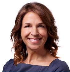
HILARY S. FRANZ,

a statewide elected official, is Washington's fourteenth Commissioner of Public Lands since statehood in 1889.