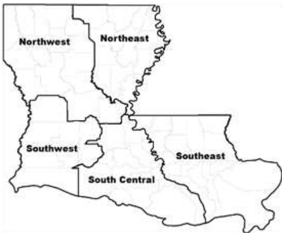
Figure 1. Statewide Flood Control Program Funding Districts for Rural Projects

D. Projects from sponsoring authorities seeking DOTD assistance in preparing applications will be scored and ranked with points awarded in the following manner.