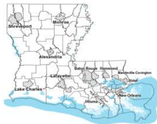
Figure 1. Statewide Flood Control Program Urban Areas Funding Group

b. Projects recommended to the Joint Legislative Committee will include a mix of those occurring in each rural funding district as well as those for urban areas of the state. The method for allocating funding percentages within each district and the method for allocating total program funds to the various districts are presented in Subchapter D, Evaluation of Proposed Projects and Distribution of Funds.