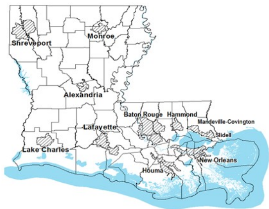
Figure 1. Statewide Flood Control Program Urban Areas Funding Group

b. Projects recommended to the Joint Legislative Committee will include a mix of those occurring in each rural funding district as well as those for urban areas of the state. The method for allocating funding percentages within each district and the method for allocating total program funds to the various districts are presented in Subchapter D, Evaluation of Proposed Projects and Distribution of Funds.