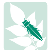
Emerald Ash Borer

http://www.emeraldashborer.info/files/arborist.pdf