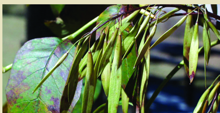
White ash seeds