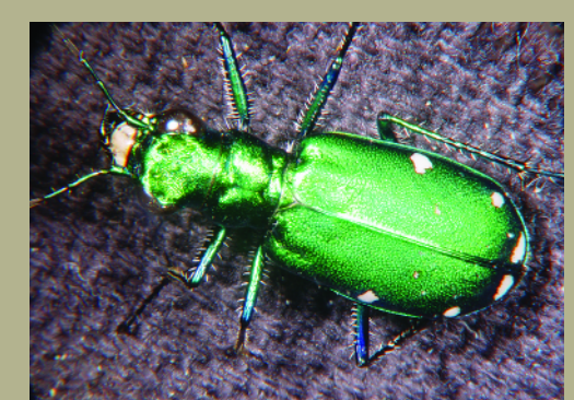
Six-spotted Tiger Beetle