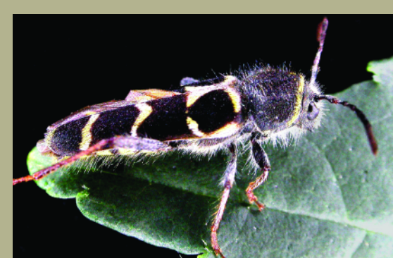
Banded Ash Borer