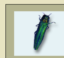
Adult (1/2 inch)