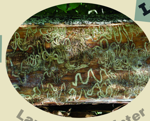
Larvae overwinter under bark