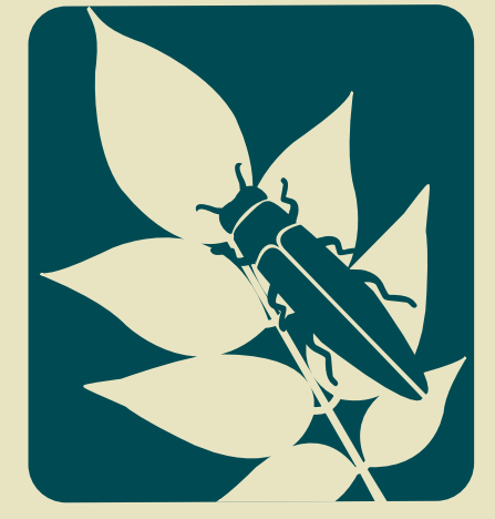
Emerald Ash Borer