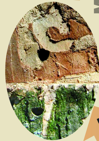
Adults emerge leaving D-shaped exit holes