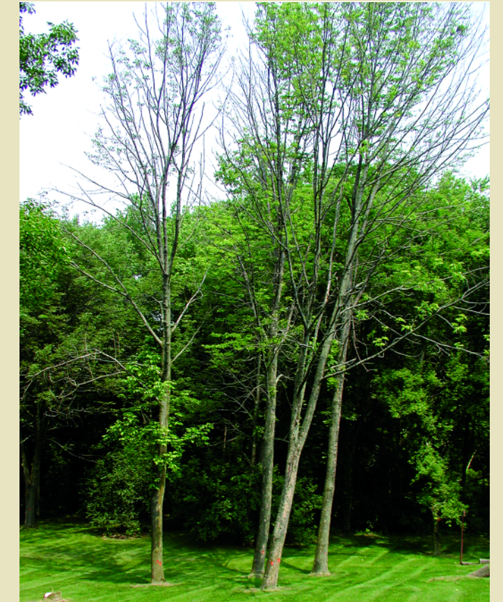
Sick ash trees

The borer prefers white, green, blue and black ash, but not mountain ash.