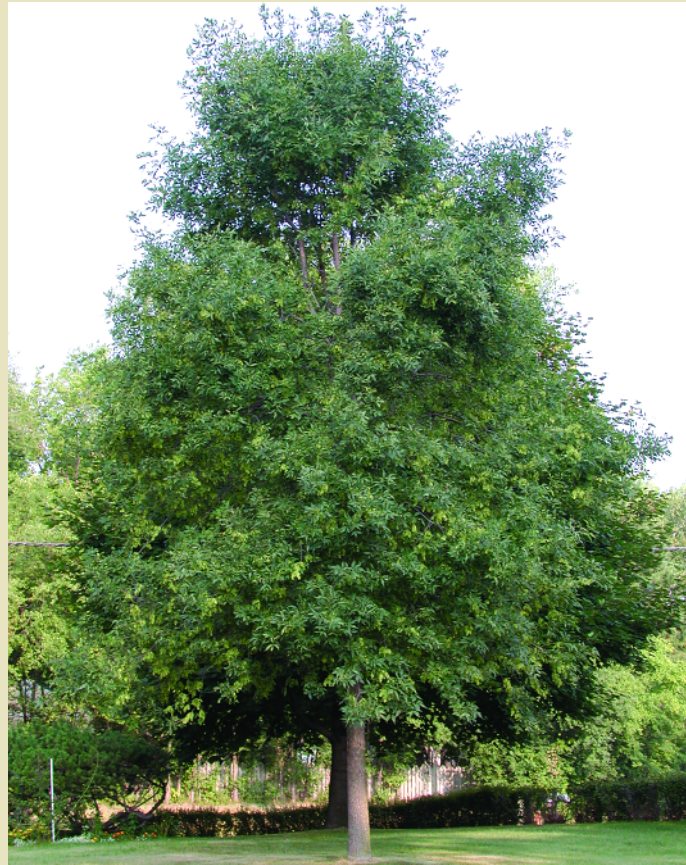
Healthy ash tree

The borer prefers white, green, blue and black ash, but not mountain ash.