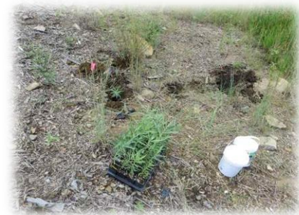
Figure 4: Showy Milkweed monitoring site.

Landscape-wide loss of milkweed, the only larval food source for monarch butterflies, is recognized by conservationists as a major factor in monarch butterfly declines. Milkweed provides nectar to a large suite of pollinators which include native bees also suffering population declines, especially bumble bees ( Bombus spp.) which have recently attracted great conservation concern. NMAMLP initiated seeding and planting of the perennial Asclepias speciosa (Showy Milkweed, Fig. 2) and A. tuberosa (Butterfly Milkweed) at the VPR Swastika Mine and Dutchman Canyon Reclamation Project. Plans include