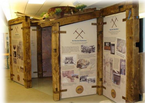
Figure 1: Exhibit on AML safety and N.M. mining History.

The Mining and Minerals Division staff is working with EMNRD Information Technologies Office to publish Story Map Journals on the intranet website as a form of public outreach. The Story Map/Story Map Journal is a recent form of Esri Web Mapping application that offers the use of templates available on the Esri ArcGIS Online internet environment in order to relate web maps to narrative text, hyperlinked text and multimedia such as photos and video. Staff has been developing the plans (storyboard) and gaining permissions to use the ArcGIS Online for Organizations account to premiere a Story Map Journal that educates and informs the public about NMAMLP projects and initiatives.