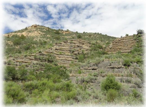
Figure 3: Sugarite remedial reclamation on steep slopes.

In Evaluation Year 2015 AML completed nine abandoned mine safeguarding and reclamation projects, including six small construction projects. These small construction projects were to install a concrete plug at a hard-rock mine subsidence in the village of Santa Clara in Grant County; to construct two bat gates at Cookes Peak for a scientific study on the effects of gating on bats; to fill a coal mine adit and subsidence in Madrid; to plug a coal mine vent shaft near Madrid using polyurethane foam; to safeguard a couple of other coal mine openings and to maintain previous bat compatible mine closures near Madrid; and to seed and mulch bare areas at the Swastika coal mine reclamation site near Raton.