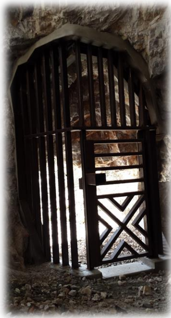
Figure 2: Harding Pegmatite Mine bat gate closure that allows passage for tours.

2) Harding Pegmatite Mine (Taos County) – The Harding Pegmatite Mine, situated five miles east of Dixon in north central New Mexico, is a historic and geologic treasure that has made significant contributions to the scientific understanding of the origin of pegmatites and associated