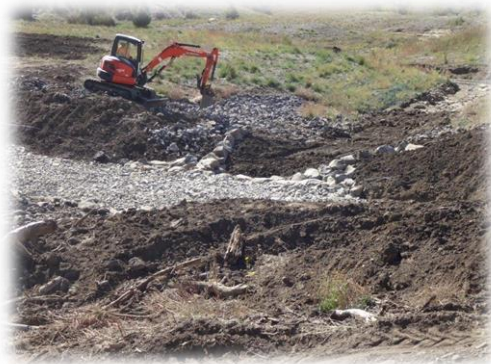
Figure 4: Swastika Mine Stream Construction Maintenance Project.

In August 2014, remedial reclamation of gob (coal mine waste) piles in Sugarite Canyon State Park and in nearby Yankee Canyon in Colfax County was completed in the Sugarite Gob Reclamation Phase VIII project. In September 2014, the Grants Uranium – Hogan Mine Phase I Project in Grant County was completed to safeguard a uranium mine shaft using a cap of precast concrete panels. Another project, the Vermejo Park Ranch – Swastika Mine Stream Crossing Maintenance Project, removed storm-damaged culverts installed in an earlier reclamation project and replaced them with a hardened low-water crossing in September and October 2014. The San Pedro Phase I Mine Safeguard Project was completed in