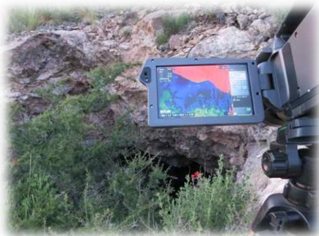
Figure 3: FLIR poised to capture exits of bats at sunset.

NMAMLP checked out a FLIR video camera from TIPS to continue collecting data on bat exit counts at abandoned mines either pre- or post-construction. This year the emphasis has been in areas of Southwest New Mexico: Cookes Peak West pre-construction site (multiple times over the warm season, Fig. 1) and post-construction Granite Gap and Lake Valley sites. Bat use of wetland restoration at the VPR Swastika Mine and Dutchman Canyon Reclamation Project continues. FLIR video recording was also part of the long-term monitoring at selected