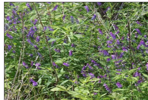
These may look like weeds, but to many wildlife species this would be a perfect place to find food, nest, raise young, escape from predators, or rest.