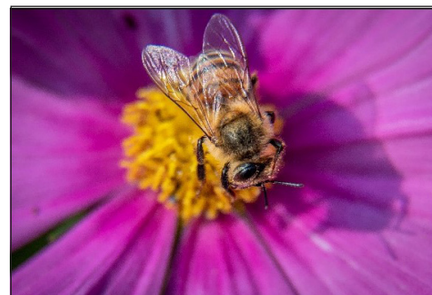
Natural areas provide supplemental food sources to all kinds of species.

Disking – Disc harrowing is a preferred method of disturbing the soil and vegetation. The only equipment needed is a tractor and disc harrow. The blades on the harrow should be set as straight as possible.