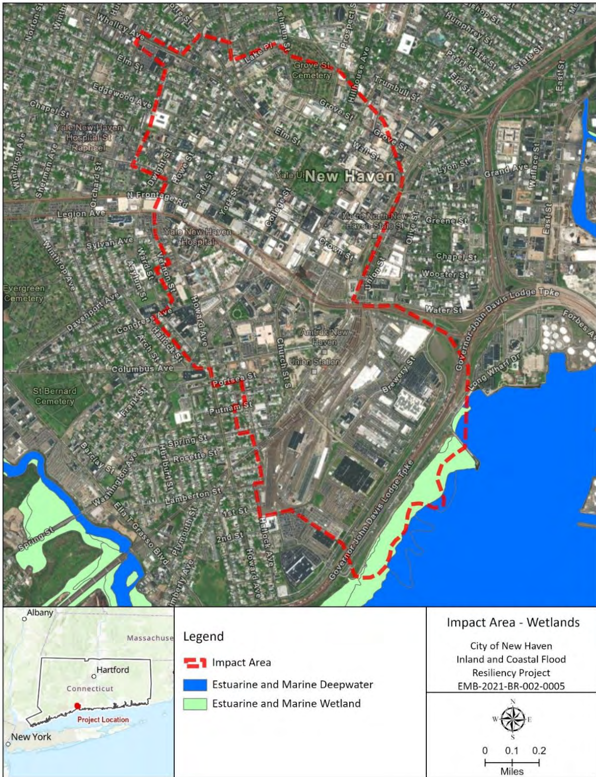
Figure 4-1. Project Area Wetlands