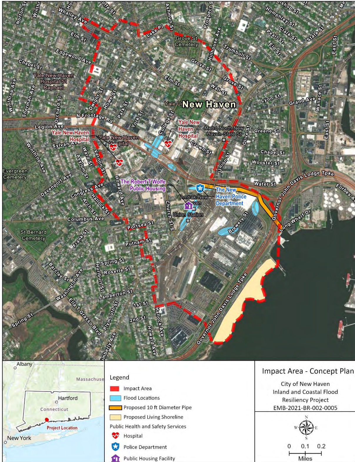
Figure 3-1 Impact Area