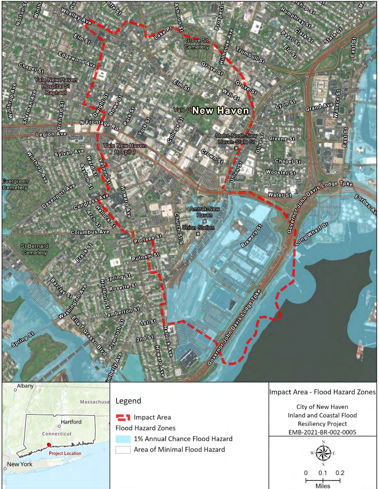
Figure 4-2 Floodplain Map