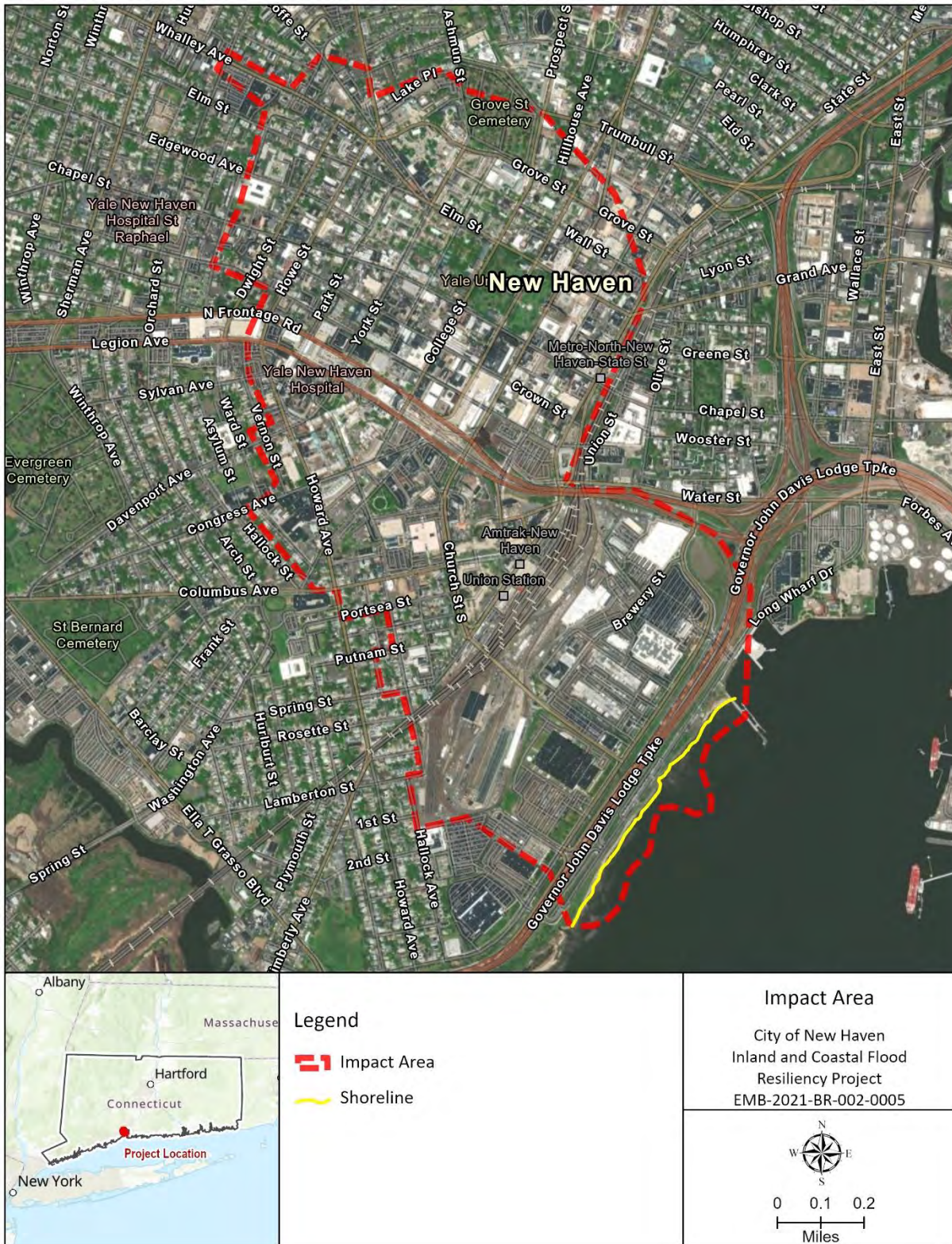
Figure 1-1 Project Impact Area