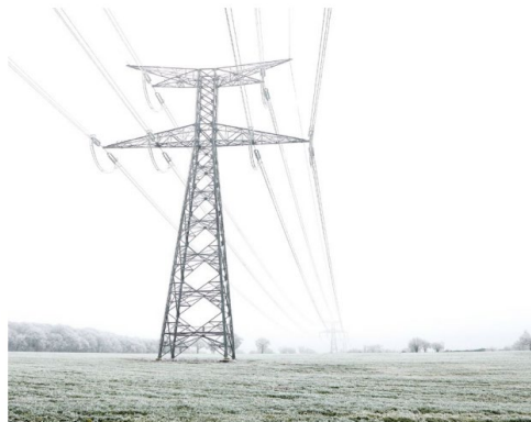
Ice covers electrical sources