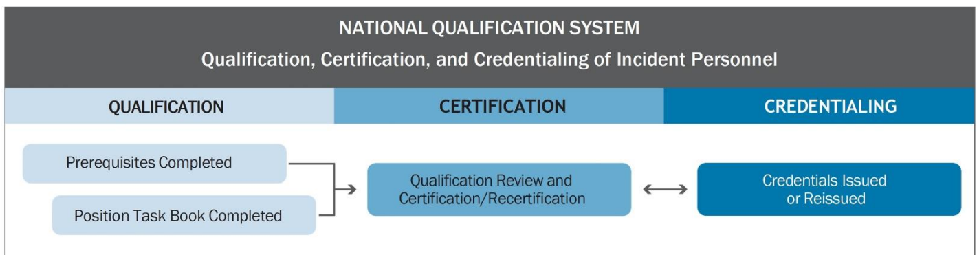
Figure 2: NQS Concept of Operations

The three major components of NQS consists of Qualification, Certification and Credentialing. Figure 1 depicts the continuum of the integrated qualification, certification, and credentialing processes that constitute NQS. A summary of activities for each of the three processes is described below.