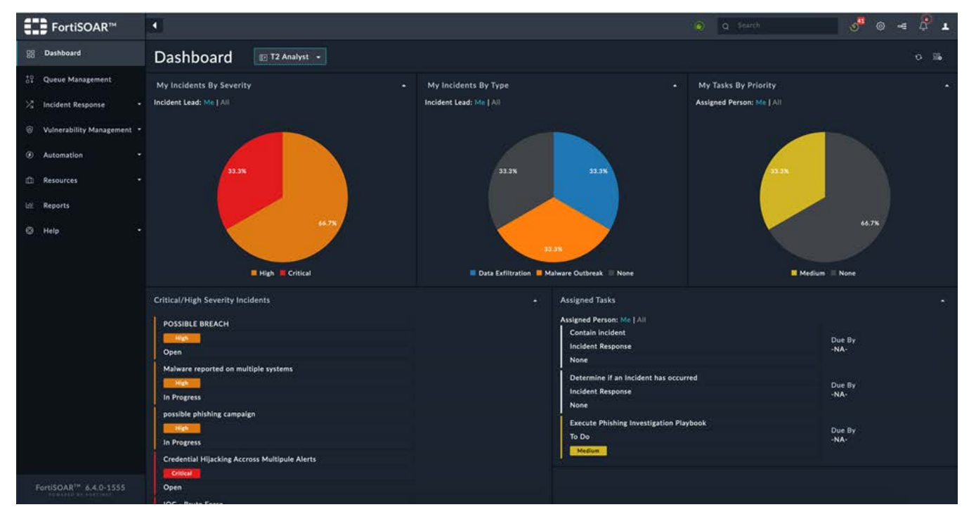
Figure 2: FortiSOAR dashboard.

FortiSOAR is a holistic security orchestration, automation, and response workbench, designed for SOC teams to efficiently respond to the ever-increasing influx of alerts, repetitive manual processes, and shortage of resources. This patented and customizable security operations platform provides automated playbooks, incident triaging, and real-time remediation for enterprises to identify, defend, and counter attacks. FortiSOAR optimizes SOC team productivity by seamlessly integrating with over 300 security platforms and over 3,000 actions. This results in faster responses, streamlined containment, and reduced mitigation times from hours to seconds.