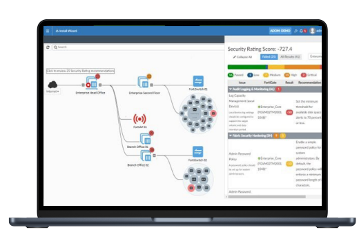
Intuitive view and clear insights into network security posture with FortiManager