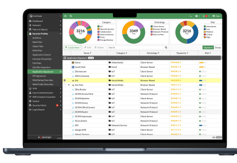
Visibility with FOS Application Signatures