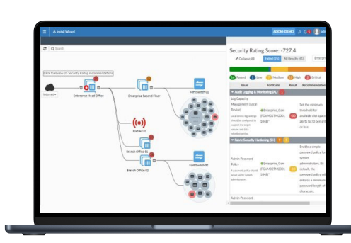
Intuitive view and clear insights into network security posture with FortiManager