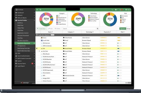
Visibility with FOS Application Signatures