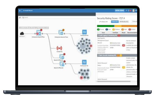
Intuitive view and clear insights into network security posture with FortiManager