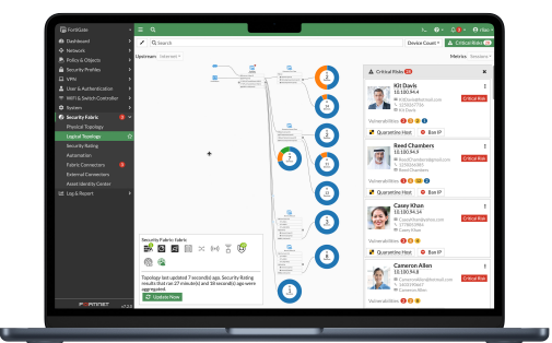
Intuitive easy to use view into the network and endpoint vulnerabilities