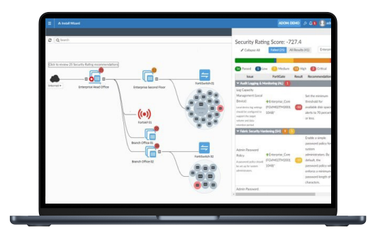
Intuitive view and clear insights into network security posture with FortiManager