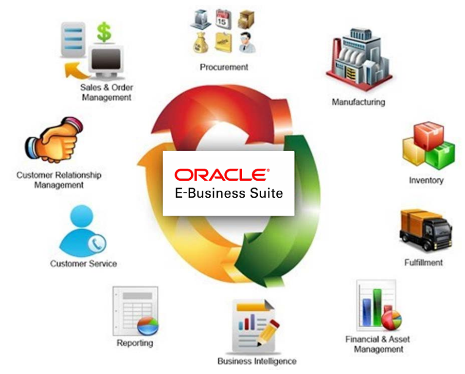
Figure 1: The Oracle E-Business Suite applications.