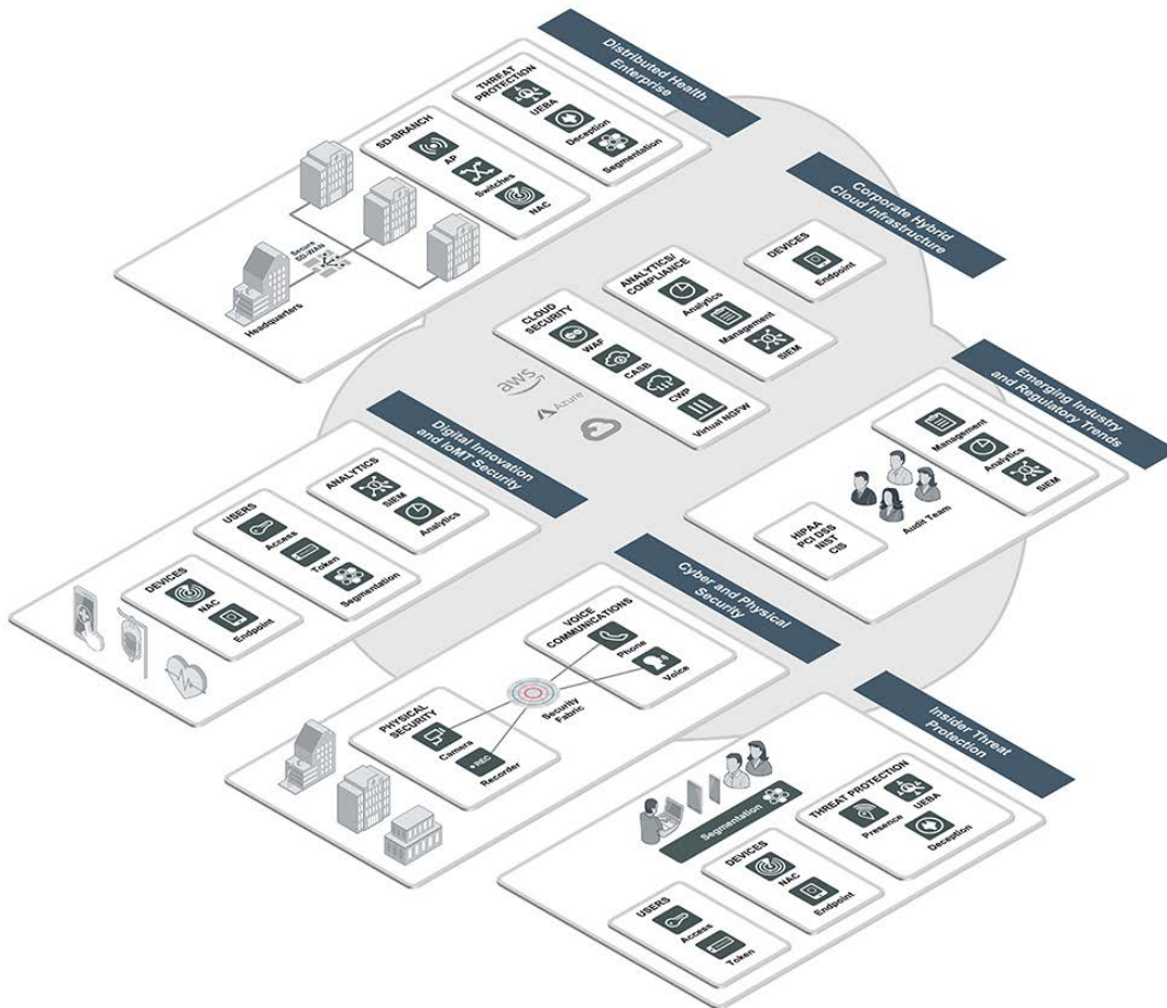
Figure 1: Healthcare cybersecurity use cases.