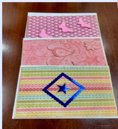
Hand-crafted art made with love by our seniors.