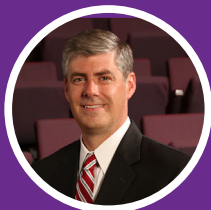
Commissioner Bob Ellis Priority Area Liaison

In order to deliver on the citizen-centric priority above, Fulton County government must recruit and develop a competent, engaged workforce and maintain a collection of facilities, equipment and technology that enables high performance. In addition, the County must manage its finances wisely and develop and follow policies that promote both efficient and effective practices. Finally, the government must promote trust among its citizens by regularly reporting on its performance, conducting itself in a transparent and legal manner, and engaging with its residents in setting the direction of county government.