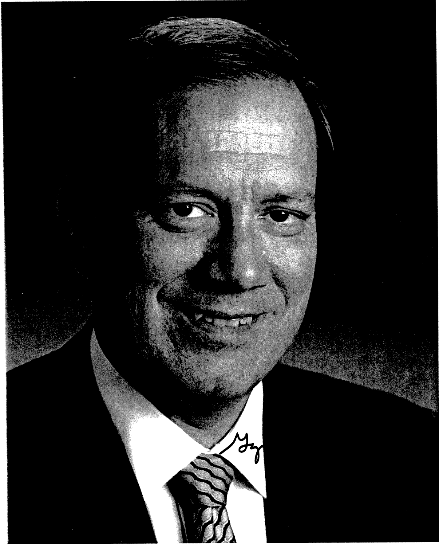
George E. Pataki, Governor