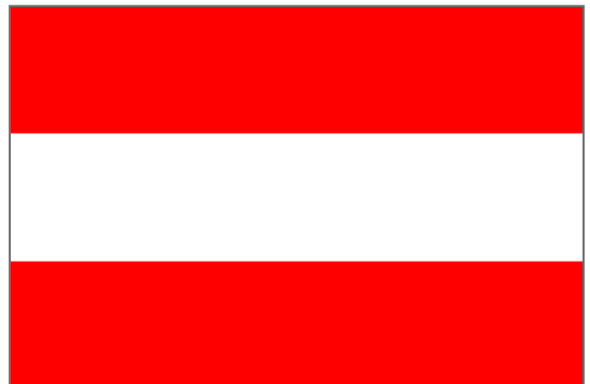
Current Austrian flag