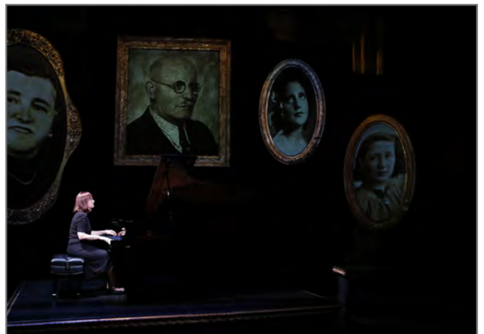
Mona Golabek in The Pianist of Willesden Lane .

Imagine you and a friend are famous artists in Vienna in the 1930s. You can decide what skill you have – a visual artist, a vocalist, a pianist. You are sitting at a coffee shop “passionately defending your latest creation.” Decide what your latest creation is and improvise this conversation between you two.