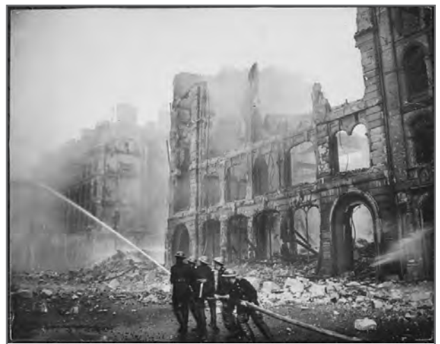
Firemen work on a bomb damaged street in London, 1941.

The bombing began on the afternoon of September 7, 1940. Almost 1,000 German aircraft crossed the English Channel. This was the largest collection of aircraft ever seen at that time (BBC). The RAF scrambled to intercept the German planes, which led to a huge dogfight over London and the River Thames. The country was put on the highest alert, expecting