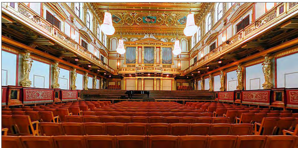
Golden Hall in the Musikverein in Vienna, Austria.