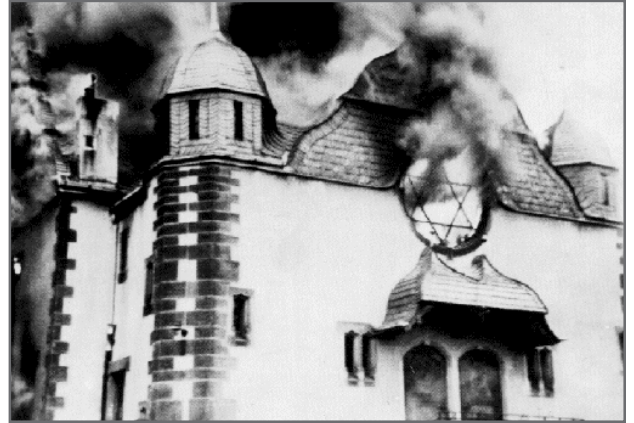
A synagogue burned on November 9, 1938 – Kristallnacht.