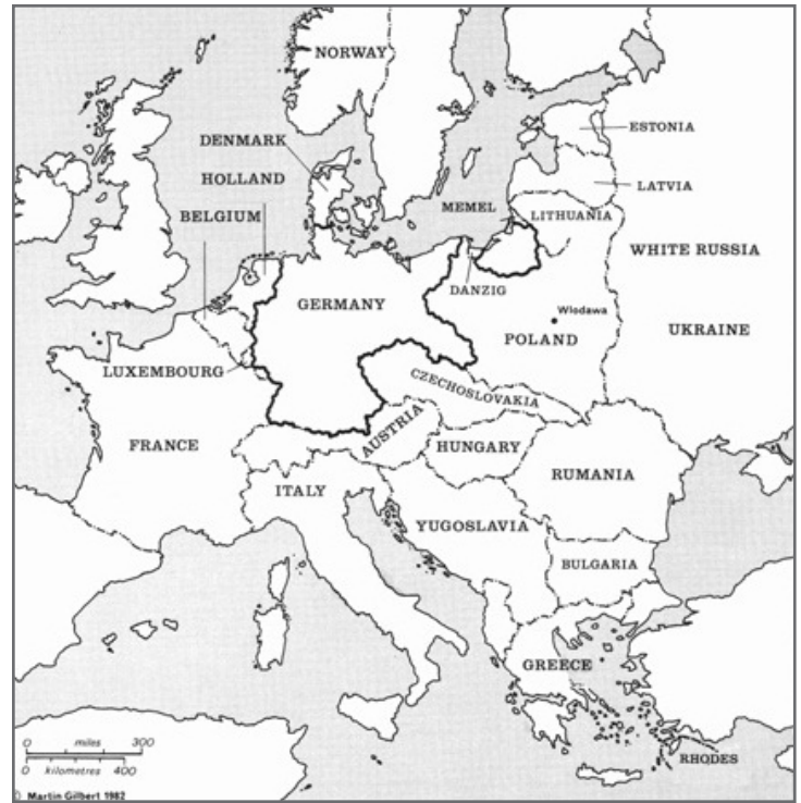
Europe before World War II.