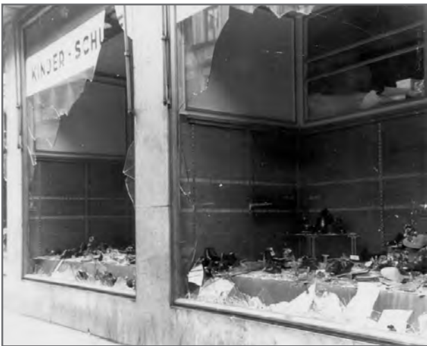
A Jewish shop window broken on Kristallnacht, 1938.

In the days following Kristallnacht, the Nazi party grew even bolder in their campaign to humiliate, incarcerate, and eventually eradicate the Jewish population. Goebbels spoke proudly of the destruction of the synagogues, stating, "They stood in the way long enough. We can use the space made free more usefully than as Jewish fortresses" (The American Experience). The Jewish community was issued a fine of one-billion marks, or 400 million U.S. dollars (Marcuse), for the death of vom Rath, and it was also determined that they would be held liable for all damages caused during the destruction of their own property during Kristallnacht.