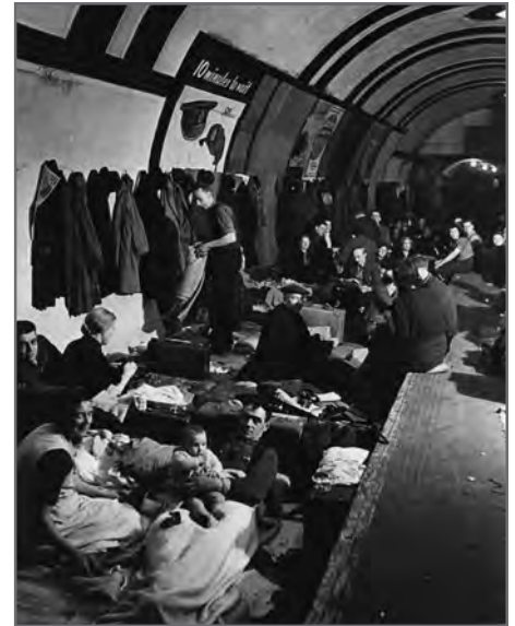
An air raid shelter in the London Underground during the Blitz, 1940s.

The Autobiography . “He was wrong. The city’s inhabitants, on the contrary, took a perverse and particular pleasure from being the front line of war. ‘We can take it’ became the catchphrase of the Blitz” (The History Channel). The famous “KEEP CALM AND CARRY ON” signs, now found so commonly in home design shops, were created and posted about the city during this time. While the city of London dealt with unimaginable hardship and suffering during the Blitz, they did just that: they kept calm, and they carried on. And the city of London rose back up from the ashes of the Blitz.