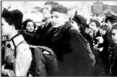
German Jewish children on the Kindertransport.

On December 2, 1938, approximately 200 Jewish orphans were brought to Harwich, England, due to a rescue operation called the Kindertransport. Following the Kristallnacht , the Night of the Broken Glass, when outraged Nazi soldiers killed and tortured nearly one hundred Jews and destroyed thousands of Jewish businesses and homes, organizations from England and Germany sought immediate immigration for children living in Germany and Austria. The Kindertransport brought children from Austria, Poland, Czechoslovakia, and Germany to Belgium, Switzerland, Sweden and England. Many of them went on to live fulfilling and remarkable lives.