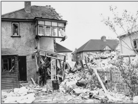
A home in East London is damaged by a German dropped bomb during the Blitz, 1940.

“The siren went about 9:00 pm and very soon the whole area was completely ringed with flares. It was a most amazing sight. Mum and I took shelter in the cupboard under the stairs.... We didn’t hear a thing when the bomb hit. All we felt was the sensation of a lift [or elevator] rushing down, but of course we had been lifted up first. Eventually everything settled down and there, right in front of us, was a perfectly shaped tunnel. Unfortunately, my leg was pinned down by a beam, so I could not move.” (Netherstreet)