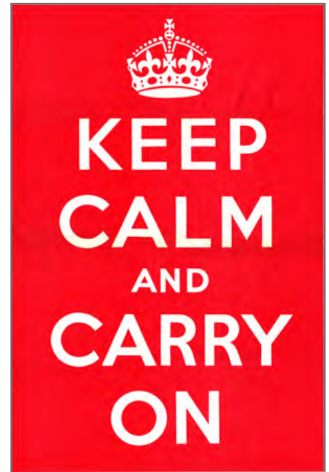
A reproduction of a 1939 British World War II poster which was rediscovered in a bookstore in 2000.