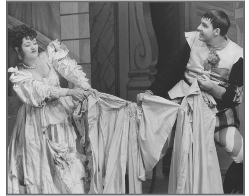
Lynn Fontanne and Alfred Lunt in The Taming of the Shrew (1935).

Lunt and Fontanne's turns in The Taming of the Shrew made it one of the most popular productions the play had ever had. It had a cast of 52, including acrobats, musicians, and comic horses, and it ran, on and off, in New York and on tour, for five years. But it's remembered less for its scale than for the way Lunt and Fontanne played their roles. As Katharina, Fontanne threw objects from offstage at Lunt's Petruchio. When she finally came on stage, he spanked her. And their onstage behavior was widely perceived to mirror a tumultuous off-stage relationship.