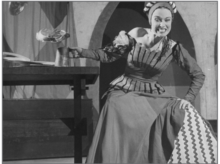
Patricia Morrison in the original production of Kiss Me, Kate .

When Kiss Me, Kate opened on Broadway in 1948 it more than justified the Spewacks' faith in Porter. It ran for 1,077 performances in New York. The New York Times critic Brooks Atkinson wrote that "Kiss Me, Kate," had "the best musical comedy book of the year" and that Porter had "written his best score in years." It won 5 Tony Awards, for Best Musical, Best Produced Show, Best Script, Best Score and Best Costumes.