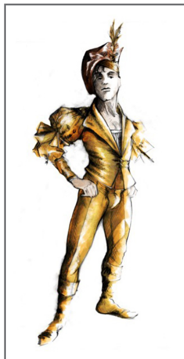
Lucentio and ensemble women from The Taming of the Shrew . Costumes design by Fabio Toblini.