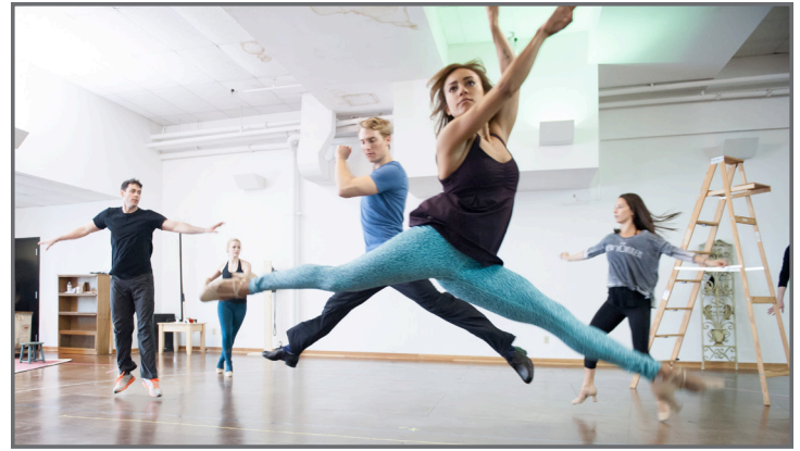
The company of Kiss Me , Kate rehearses.

A: I started dancing when I was four. My parents put me in ballet and movement class when I was really little, and they took me to ballets, and I just... I was hooked from the time I was tiny. I always knew what I wanted to be. I was not one of those kids who was ever confused. I was a dancer from before I could even walk. They put me in classes actually because I was born with congenitally displaced hips. I was a breech birth, and it displaced the hip joints. They put me in ballet so that I could walk correctly, and then I just started liking it.