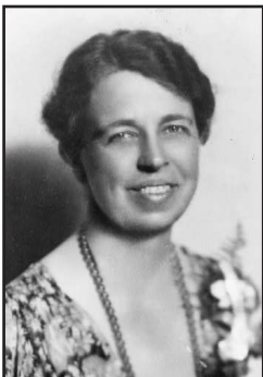
Portrait of Eleanor Roosevelt, 1933.

ADAM CLAYTON POWELL, JR. (1908-1972) was a Harlem Baptist pastor, the first African-American congressman, and an advocate for African-American civil rights. A representative of Harlem, he fought segregation and discrimination on the Hill until 1970, and became chairman of the Education and Labor Committee in 1961.