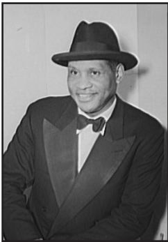
Portrait of actor, baritone, and activist Paul Robeson.

ROBERT KENNEDY (1925-1968) served as Attorney General, adviser to his brother John F. Kennedy, and Democratic Senator, and was assassinated during his presidential campaign. He was a supporter of the Civil Rights Movement, and lobbied for African-American rights.