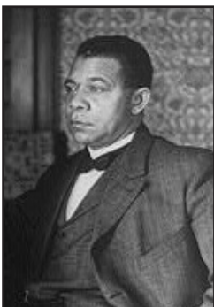
A stereograph card of Booker T. Washington, circa 1906.

BOOKER T. WASHINGTON (1856-1915) was an educator, orator, author, founder of the Tuskegee Institute, and leader in the African-American community throughout his life. A much more moderate reformer than some of his contemporaries, Washington believed that education and work, rather than legal and political action, were key to elevating the status of African-Americans.