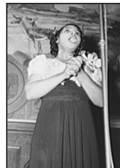
Marian Anderson sings at the dedication of a mural commemorating her performance at the Lincoln Memorial.

ALBERTA HUNTER (1895-1984) was a jazz and blues singer, songwriter, and actress who reached the peak of her career during the Harlem Renaissance. In the 1950s, she enrolled in nursing school and entered the medical profession, but returned to singing for the latter part of her life.