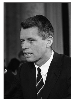
Robert Kennedy as Attorney General testifies in a senate subcommittee hearing on crime.