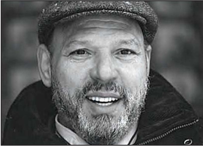
Photo of playwright August Wilson