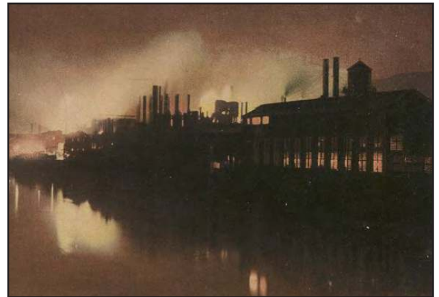
Iron Mills at night in Pittsburgh, PA.

"By the 1930s, the Hill was a national recognized Mecca of black culture and business. Like New York City's Harlem, the Hill was effectively a segregated, self-sustaining community by day, although the neighborhood's nightlife attracted people of all races."