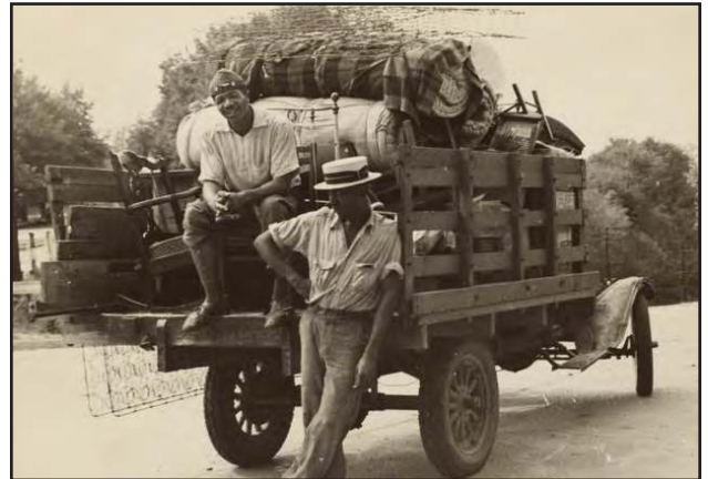
Two men rest on a truck, photographed by Ben Shahn in 1935.