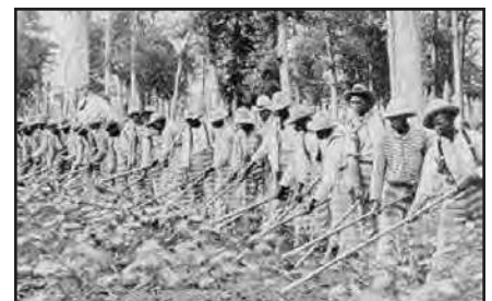
Prisoners at Parchman Farm, forced to work the fields.