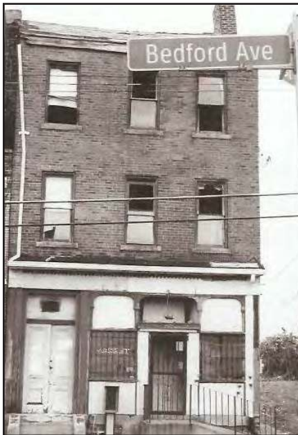
August Wilson's historic home in the Hill District of Pittsburgh.

The events of The Piano Lesson (Pittsburgh Cycle) take place.