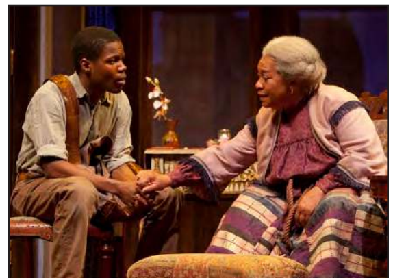
Photo from Hartford Stage’s 2011 production of Gem of the Ocean .

A CYCLE is a series of plays that chronicles a set of connected stories. Play cycles originally come from medieval theatre in which troupes traveled and performed multiple short plays that told biblical stories from creation through the resurrection. Now a play cycle may explore ongoing themes, interweaving stories, or overlapping characters.