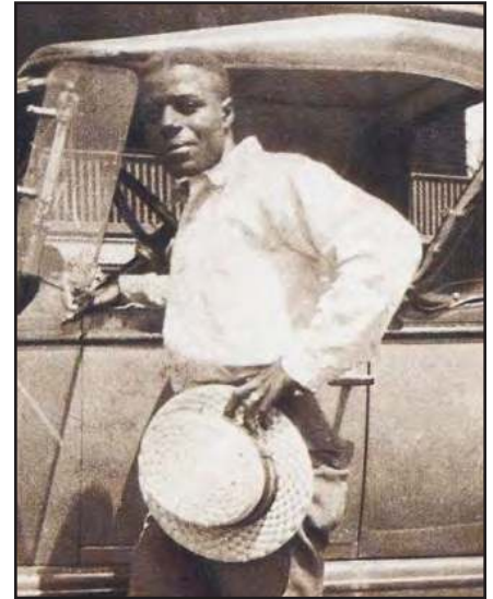
A young photo of blues musician Skip James.

Another musical perspective is offered by Avery, the preacher who attempts to court Berniece