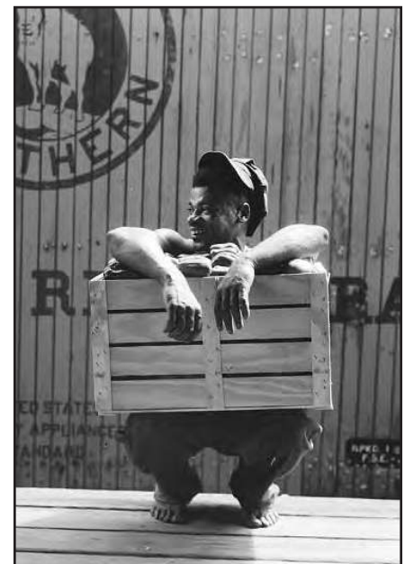
A migrant worker in 1936