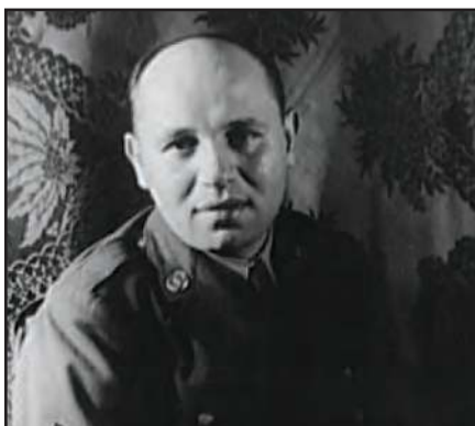
Portrait of artist Romare Bearden photographed by Carl Van Vechten.