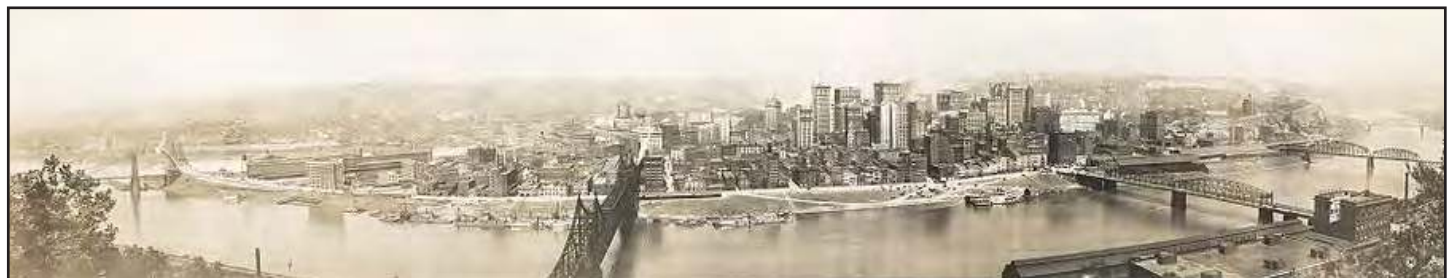
A panorama of Pittsburgh, PA photographed in 1920.

These redevelopment projects would force the relocation of thousands of poor, predominately African-American residents from the Lower Hill, the business and cultural center of the neighborhood. Politicians justified their proposals, however, by pointing to the neighborhood's overcrowded conditions, insufficient infrastructure, and declining property values, and were granted $15 million from the 1949 Federal Housing Act plus state funds. By 1961, over 8,000 residents had been displaced.