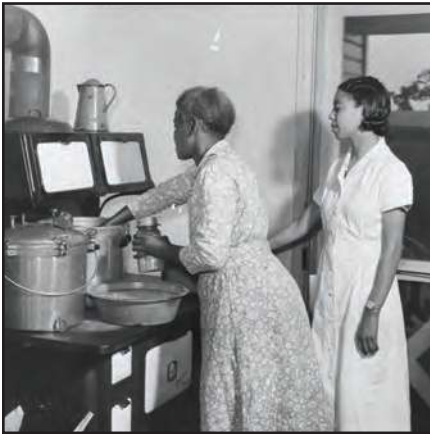
Above: Two women canning peas. Below: An African-American family on their porch in 1938.

Barack Obama is elected America's first black president.