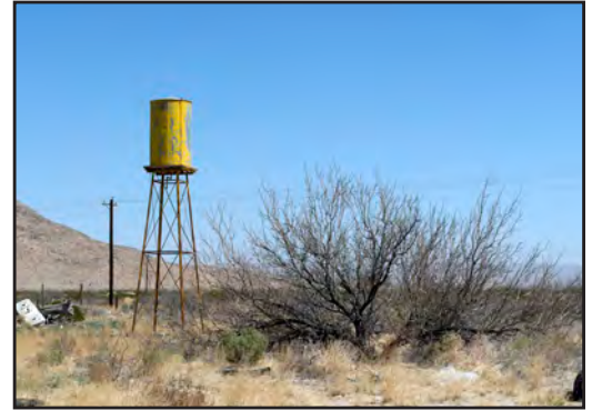
Long-abandoned water tower in the ghost town of Salt Flat along the border.