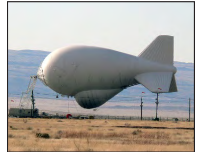
U.S. Government border surveillance balloon.

2019 In a yard sale, Joe and Manny find a hospital bedpan used by a sick woman who could not get out of bed to go to the bathroom. Convinced it is the magical helmet he has been looking for, Joe takes it, and, wearing the potty on his head like a hat, runs off without paying.