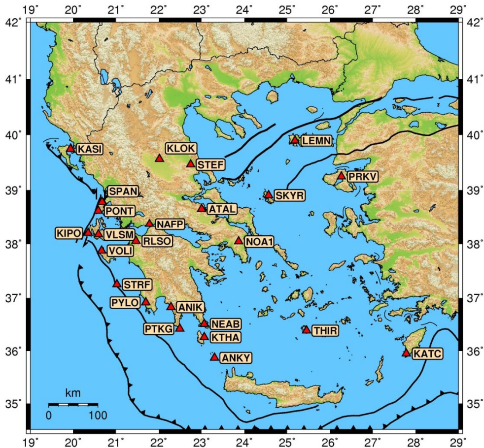
Figure 1. Relief map of Greece with locations of the permanent GNSS stations of NOANET