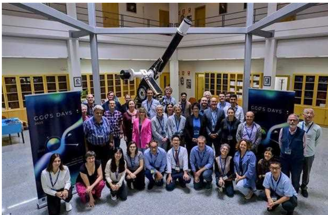
On-site participants in the GGOS Days 2023

GGOS convenes its various components annually to report on achievements and formulate activities for the future. On this occasion, the Instituto Geográfico Nacional of Spain hosted the GGOS Days in Alcalá de Henares from 20th to 22nd September 2023. The meeting was hybrid, enabling remote participation, and had 192 attendees, 40 of whom were present in person.