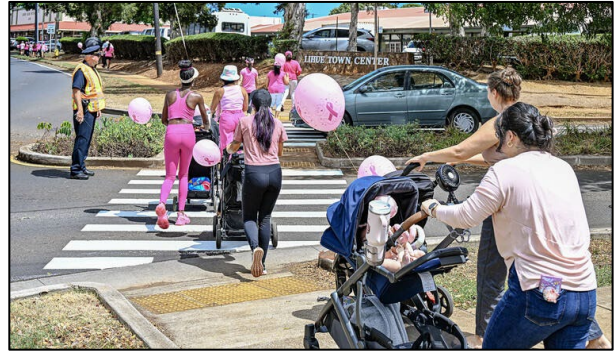
Walkers participating in the Kaua'i Committee on the Status of Women cancer walk get help from a Kaua'i Police Department officer in crossing Hardy Street on Monday, Oct. 2, 2023.