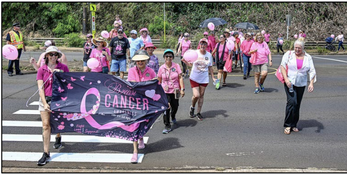
Kaua'i Committee on the Status of Women (KCSW) and supporters of Breast Cancer Awareness return safely during the KCSW walk launching October as Breast Cancer Awareness Month on Monday, Oct. 2, 2023.