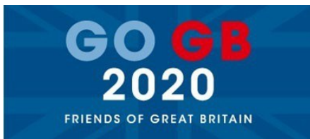
The GO GB logo, for shared use by Yokohama City, Kawasaki City, and Keio University

A branding system (joint logo, etc.) to be used jointly by Yokohama City, Kawasaki City, and Keio University was created to mutually promote and build momentum toward the hosting of the preparation camps of the British national teams. Of the design companies that participated in the proposal competition in November 2017, the company that designed Keio's 150th anniversary logo was selected as the outsourcing company and the following logo was created.