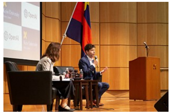
Altman responds to students' questions