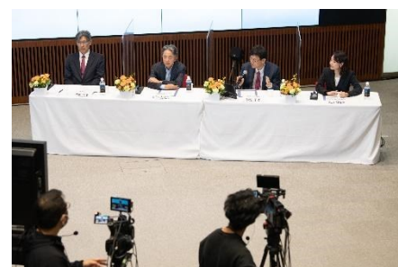
The 2022 Asahi Education Forum

Keio held lectures and a book fair to commemorate the 150th anniversary of An Encouragement of Learning. Keio also participated in the Asahi Education Forum held on November 13, 2022. In one particular session, “An Encouragement of Business: 150 years of an Encouragement of Learning”, they held presentations on the Fukuzawa and his students' entrepreneurial accomplishments, Keio's current efforts to promote startup creation and growth, and a panel discussion.