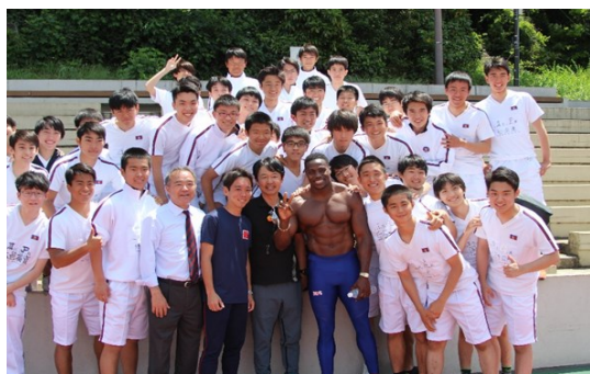
Interaction between the track and field team and Keio students

In the 2019 academic year, we had preparatory visits from the BOA and hosted test camps for Team GB athletes and staff, including those of the following teams: track and field, artistic swimming, marathon swimming, swimming, gymnastics, trampoline, judo, and taekwondo. From the BPA, preparatory visits and test camps were held by the judo, rowing, and archery teams. Some teams came to Japan on multiple occasions to ensure that they were thoroughly prepared. Furthermore, staff members of both the BOA and BPA visited several times to examine the facilities and equipment as well as to have advance meetings to discuss matters relating to the operation and coordination of the preparation camps. Students, primarily those of the Athletic Association and members of the KEIO 2020 project, provided support for the test camps and interacted with the BOA and BPA athletes.