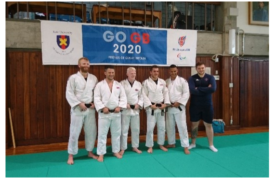
Decorations in the Judo Gymnasium

Furthermore, during the test camps, we put up decorations with GO GB logos around Hiyoshi Campus to welcome the teams and to publicize Keio University as the host of the test camps during coverage by overseas press as well as when posts were made on SNS, etc., by the athletes. During the BOA test camp in July 2019, British media outlets including the BBC, Sky Sports, and Daily Telegraph covered the teams' stay, and a member of the Keio Gymnastics and Trampoline Team was interviewed by Sky Sports.