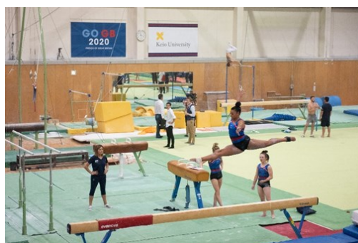
The gymnastics team practicing in the Mamushidani Gymnasium