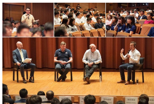
During the seminar hosted jointly with BOA

https://www.keio.ac.jp/en/news/2018/Oct/24/48-49006/