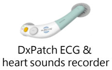
DxPatch ECG & heart sounds recorder