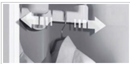
1. Moving Hanger