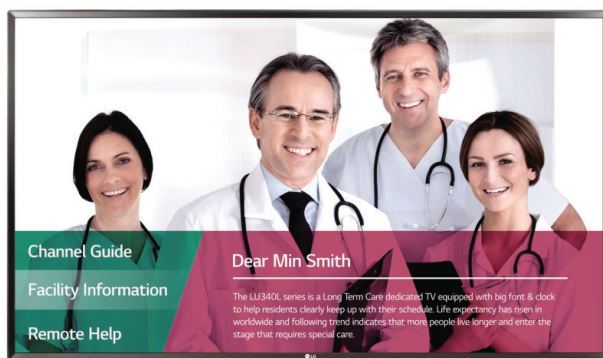
32" LT572M Series Pro:Centric® Hospital TV

information or interacting with residents. The hotel industry has already started to embrace this technology model in a significant way. Using large, commercial in-room TVs, hotels have begun offering amenities through the LG Pro:Centric® platform directly to guests, from simple checkout to richer concierge services. They've also made it easier for people to connect their own, preferred entertainment to the provided display, as well as offer branded content.