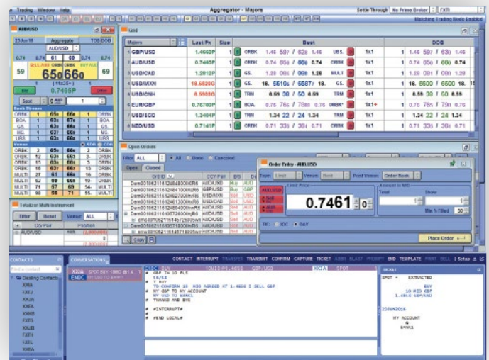
FX Trading application window