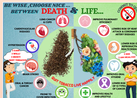
II Place - Aditya Maulana Azad Institute of Dental Sciences, Delhi