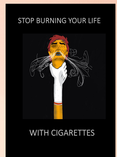
III Place - Abhishek Goyal Kasturba Medical College, Manipal