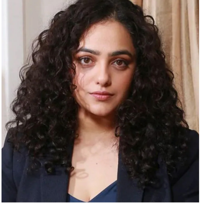
Nithya Menen Indian Actress