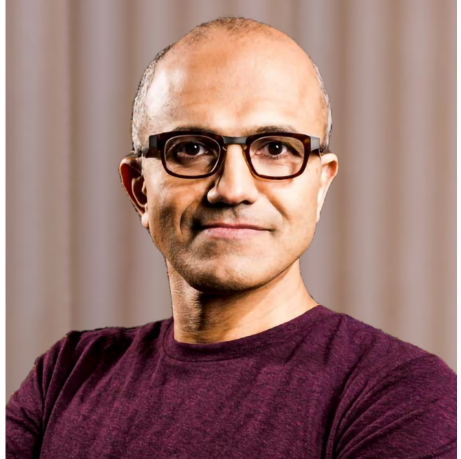
Satya nadella CEO, Microsoft