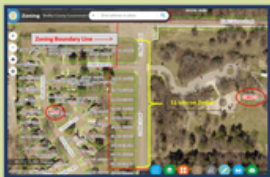
CONVERGENCE Memphis purchased 11 lots to create more inventory for affordable homes.

CONVERGENCE Memphis took a significant step toward addressing the shortage of affordable housing in the Memphis area by acquiring 11 lots through the Memphis Metropolitan Land Bank Authority. United Housing, Inc. will facilitate the construction of the new homes, which will be sold for owner occupancy in 2024. The project is supported by a partnership with CoreLogic that uses an evidence-based design tool to help non-profit developer partners create affordable, entry-level single-family homes.