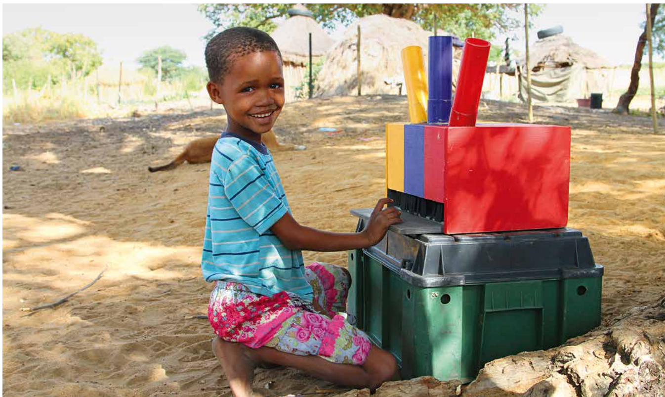
A long way from western norms: a girl from the #Akhoe Hai//om people in Namibia takes part in a psychological study.

length. However, this visual phenomenon doesn't work everywhere in the world. As Haun explains: "It already emerged back in the 1960s that there are societies in different parts of the world where people perceive the lines to be of equal length when they are (truly) of equal length – but it's impossible for us to see it." Both examples underline the fact that the way in which our cognitive abilities are expressed depends strongly on the environment in which we live – particularly our society and its culture. "You then have to ask yourself what general validity psychological experiments have that are conducted only with psychology students from the U.S. as subjects, or developmental psychology studies that observe only European babies and young infants," says Haun. At any rate, it is not always possible to make generalized statements about human perception and thought processes at this level.