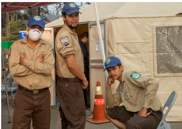
Members of the Greenwood CCC Badger Creek Camp Crew pose for a photo during the Ferguson Fire.