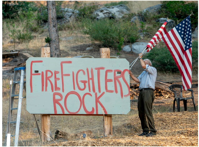
Citizens show support for fire crews during the Donnell Fire in 2018.