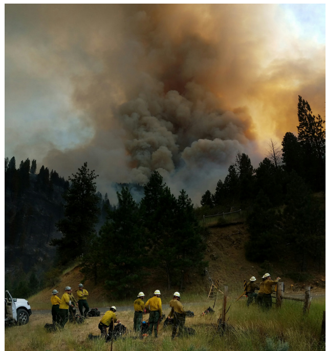
Fire crew at the Newkirk Fire in Dixie National Forest, June 2018.