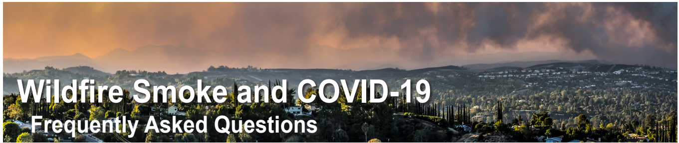
Woolsey Fire seen from Topanga, CA.