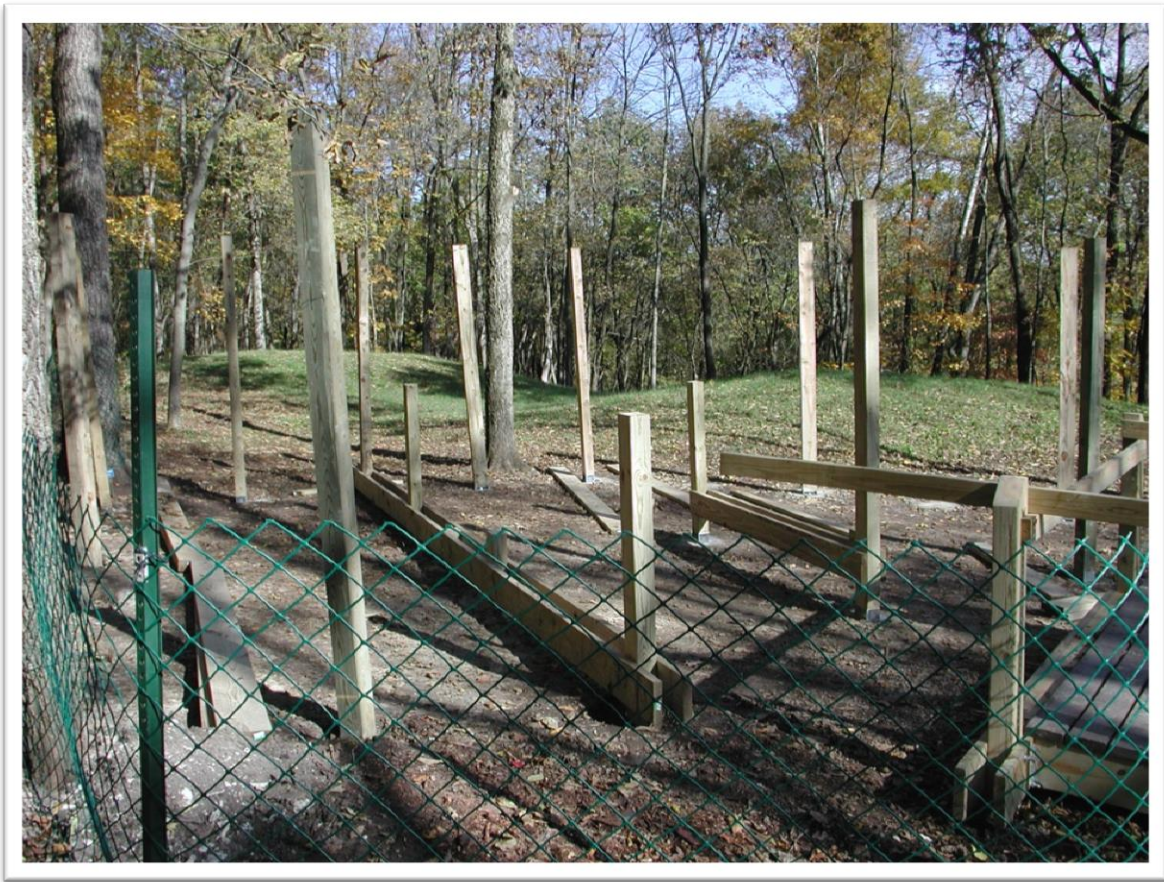
Posts with mounds in the background

The investigation revealed that during the time period of 1999-2010, monument staff failed to comply with the National Historic Preservation Act and/or the National Environmental Policy Act on at least 78 projects using $3,368,704 in federal funds, in particular an extensive system of boardwalks throughout the more than 200 American Indian sacred mounds. Although the criminal investigation focused on two projects because of the statute of limitations, associated with these projects were major project review deficiencies and in many cases a complete lack of National Historic Preservation Act Section 106 and NEPA compliance.