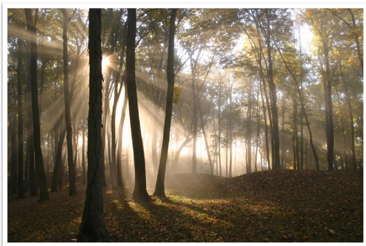
Effigy Mounds National Monument