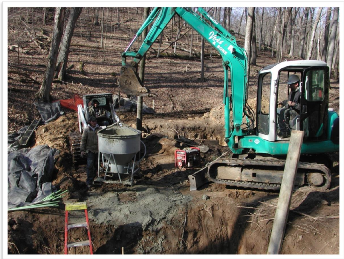
Hanging Rock bridge under construction