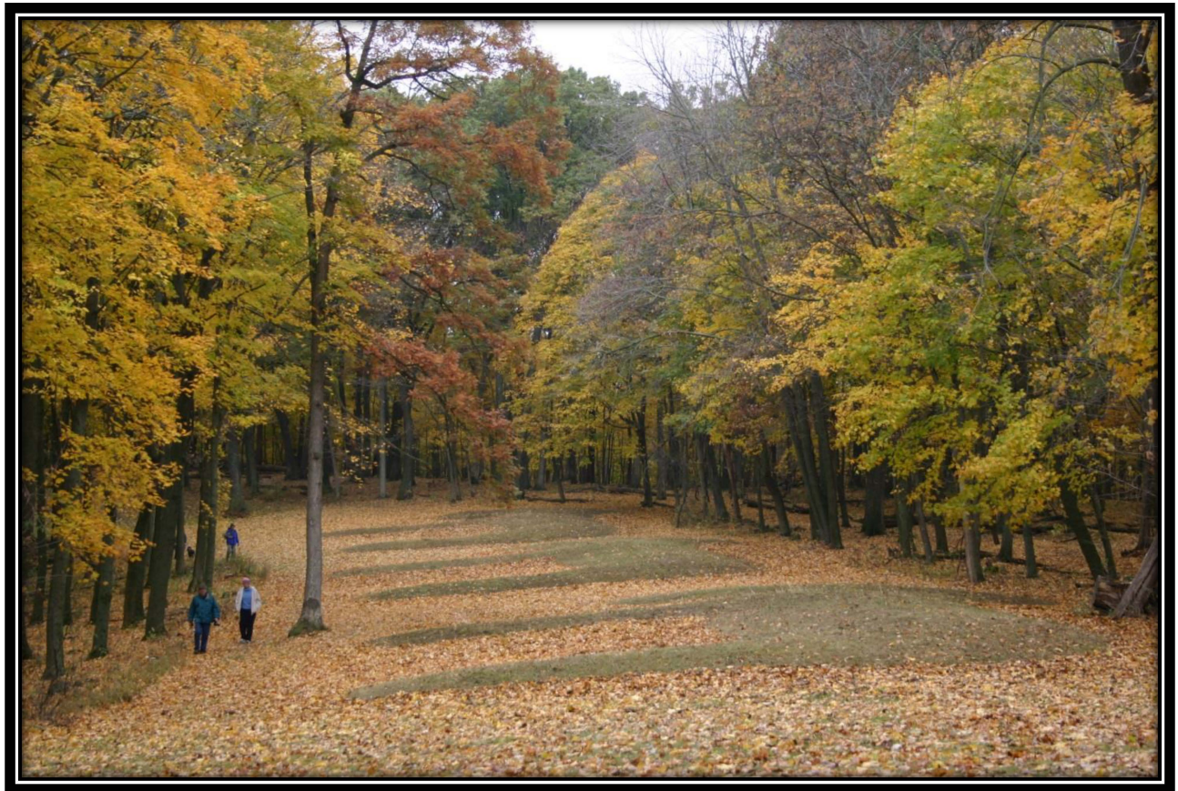
Marching Bear Mounds