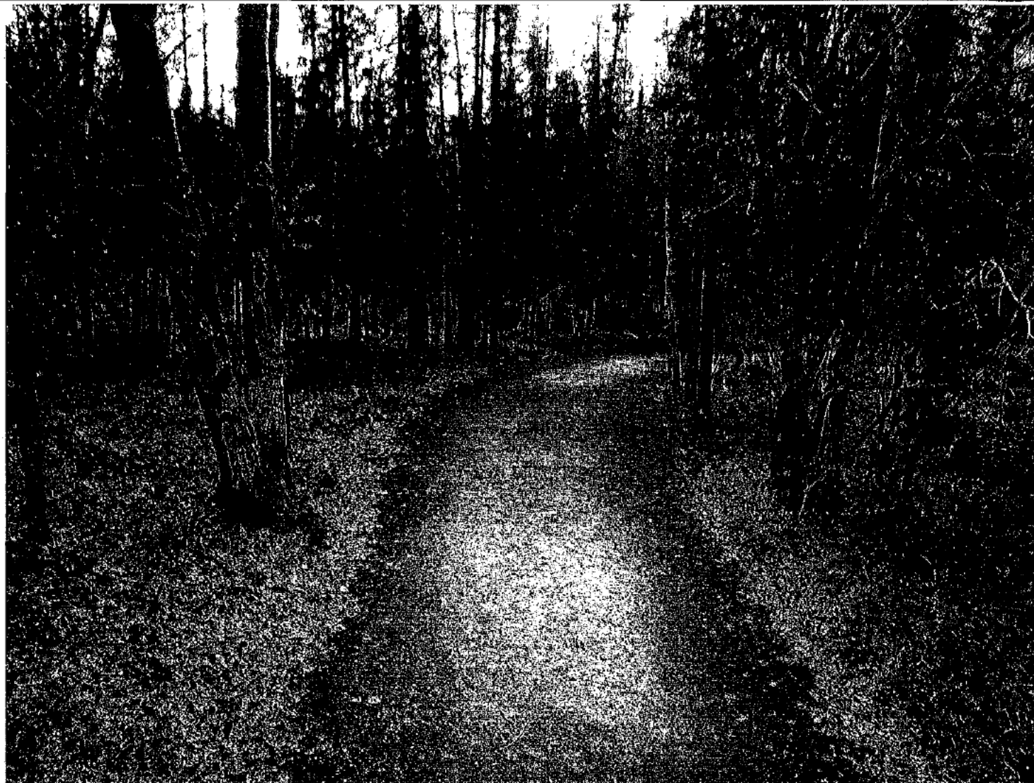
PHOTO 4 LOOKING NORTH, SHOWING BEND IN TRAIL AND DIRECTION PARTY WAS HEADING WHEN THEY ENCOUNTERED MOOSE 06/06/2013 OLYMPUS STYLUS TOUGH DIGITAL CAMERA