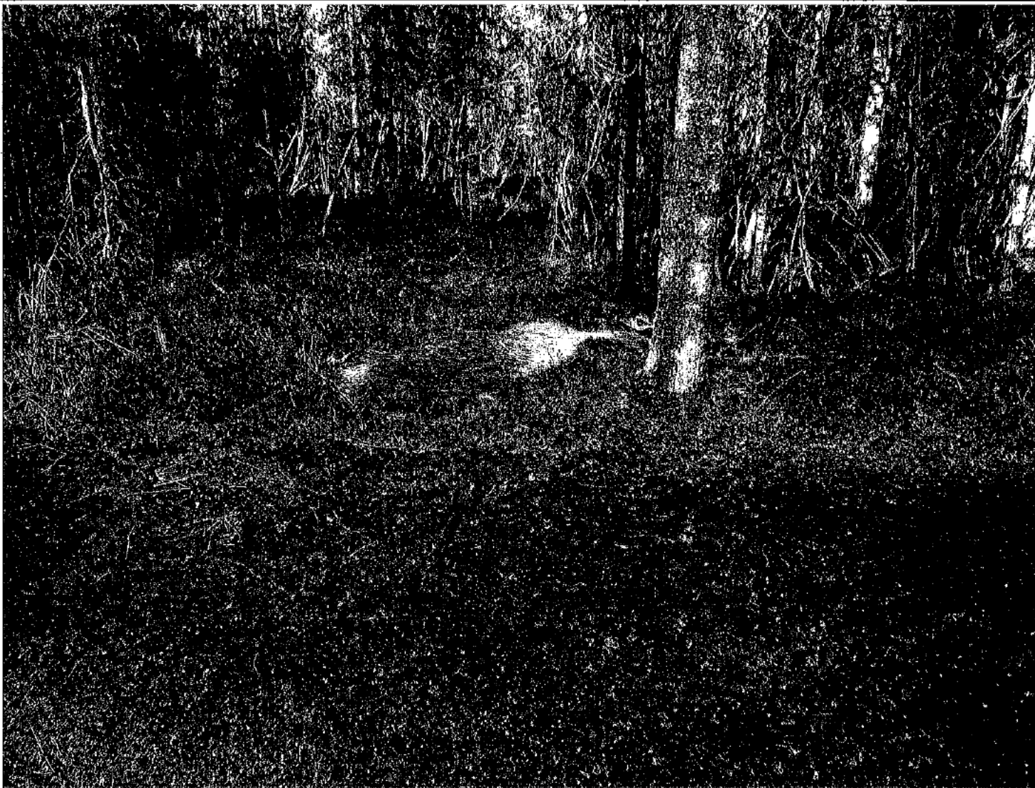
PHOTO 3 LOOKING EAST, SHOWING TRAIL AND MOOSE 06/06/2013 OLYMPUS STYLUS TOUGH DIGITAL CAMERA