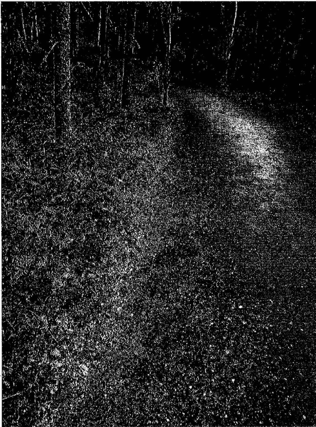
PHOTO 8 LOOKING SOUTH, SHOWING MOOSE TRACKS GOING IN THE DIRECTION OF LOCATION WHERE PARTY SAW MOOSE 06/06/2013 OLYMPUS STYLUS TOUGH DIGITAL CAMERA