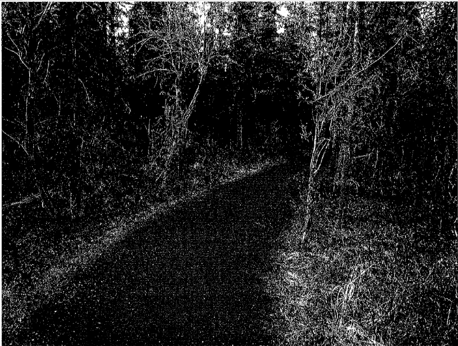
PHOTO 5 LOOKING NORTH, SHOWING BEND IN TRAIL AND POINT PARTY FIRST SAW MOOSE 06/06/2013 OLYMPUS STYLUS TOUGH DIGITAL CAMERA