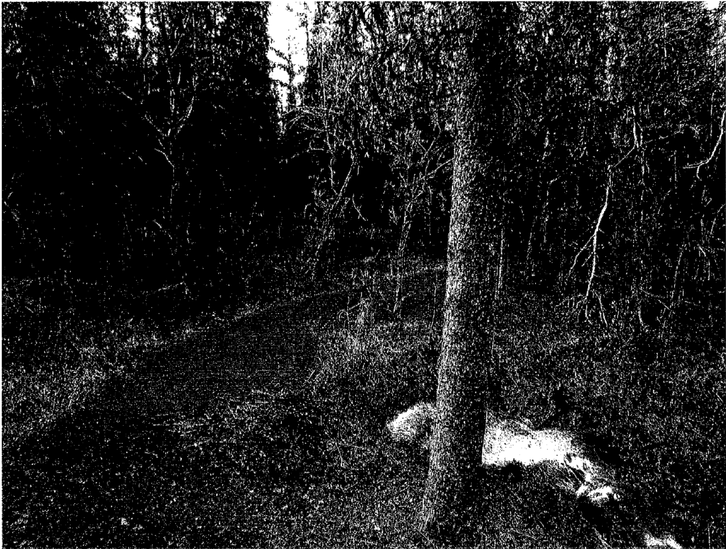
PHOTO 6 LOOKING NORTH, SHOWING BEND IN TRAIL AND TREE WHERE SIRVID SHOT MOOSE 06/06/2013

OLYMPUS STYLUS TOUGH DIGITAL CAMERA