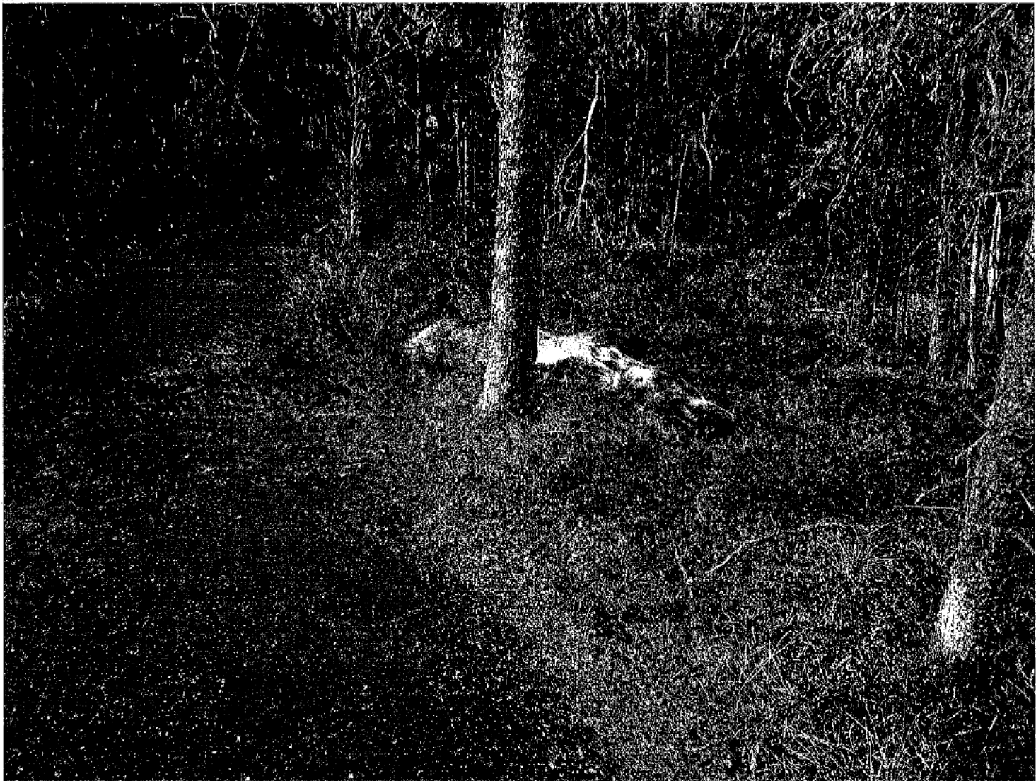
PHOTO 2 LOOKING NORTH, SHOWING TRAIL AND MOOSE 06/06/2013 OLYMPUS STYLUS TOUGH DIGITAL CAMERA