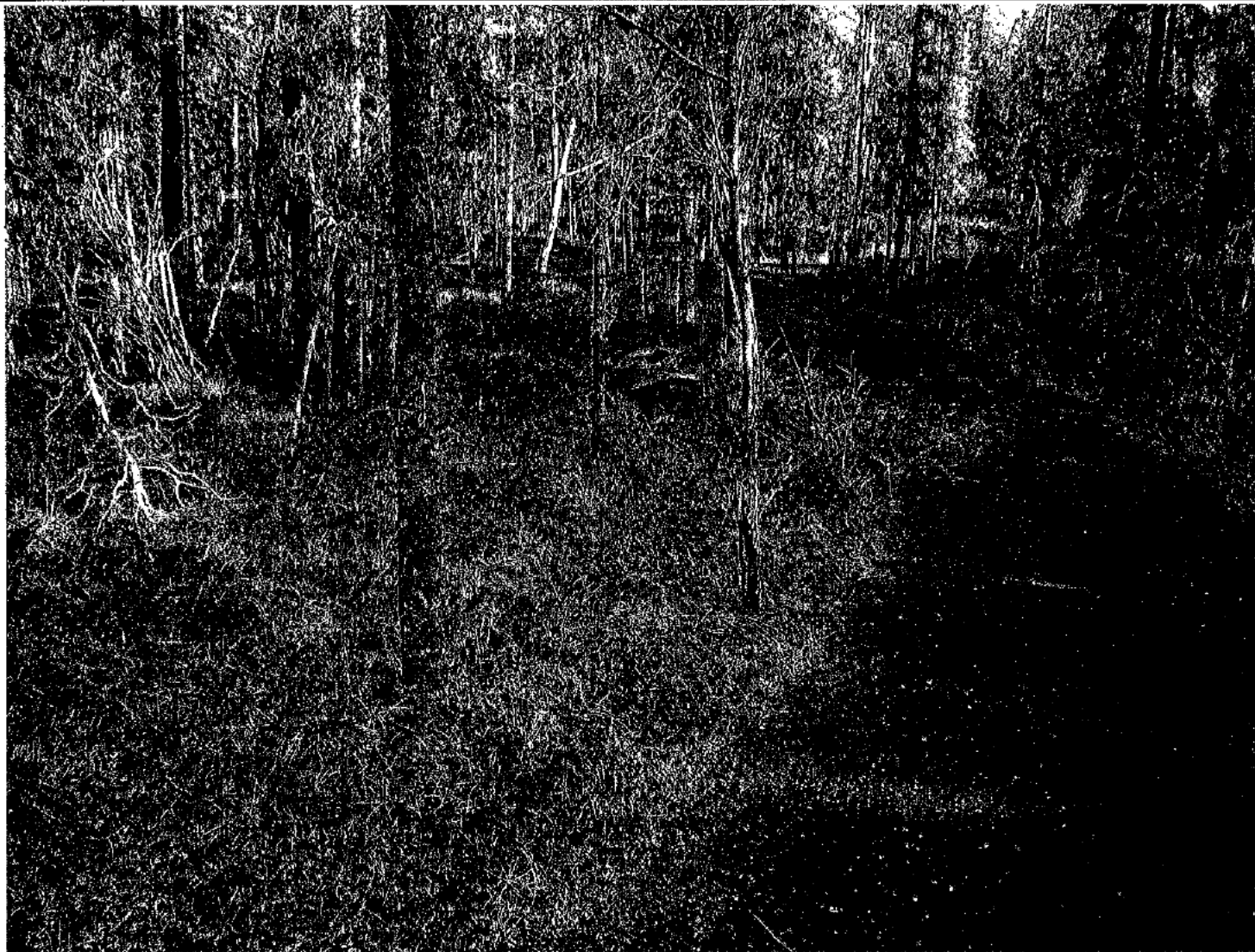
PHOTO 1 LOOKING SOUTH, SHOWING TRAIL AND MOOSE 06/06/2013 OLYMPUS STYLUS TOUGH DIGITAL CAMERA