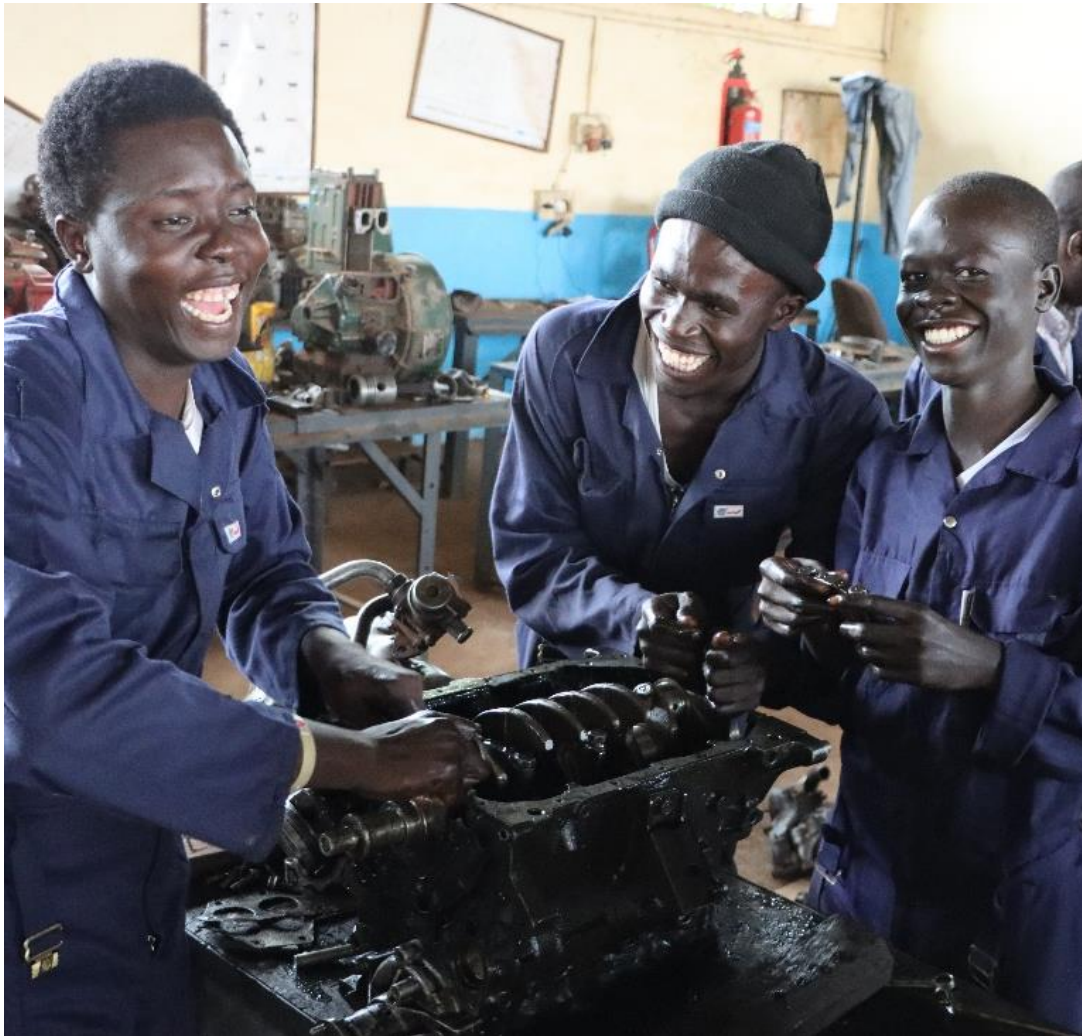
Technical vocational education (TVET) students in South Sudan ready to graduate.