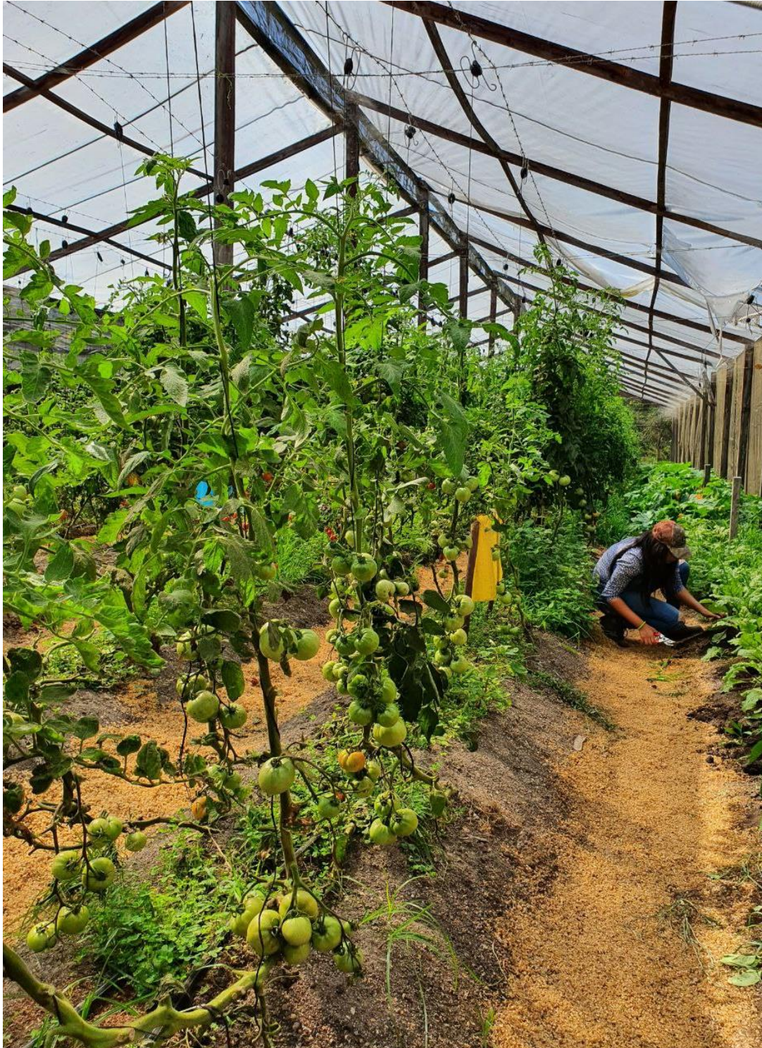
Organic tomato production in greenhouses, Honduras.