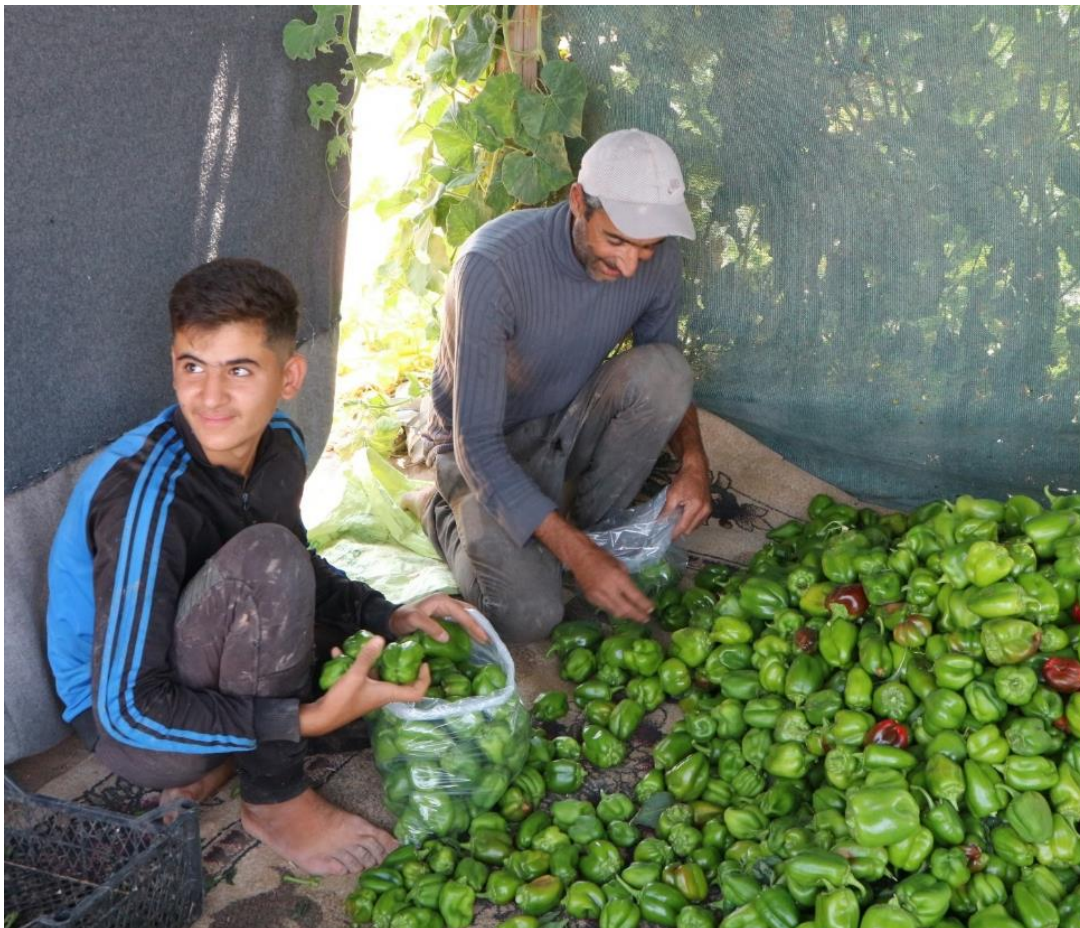
Paprika production by Syrian refugees in Dohuk, Iraq.

Please note: NRC has clear ambitions to make all our programmes more people-centric and improve how we design and implement responses as one – both across core competencies, and between programmes and advocacy. How we will go about this is still not decided. These two elements will therefore be strengthened across the core competency development strategies as part of the mid-term review.