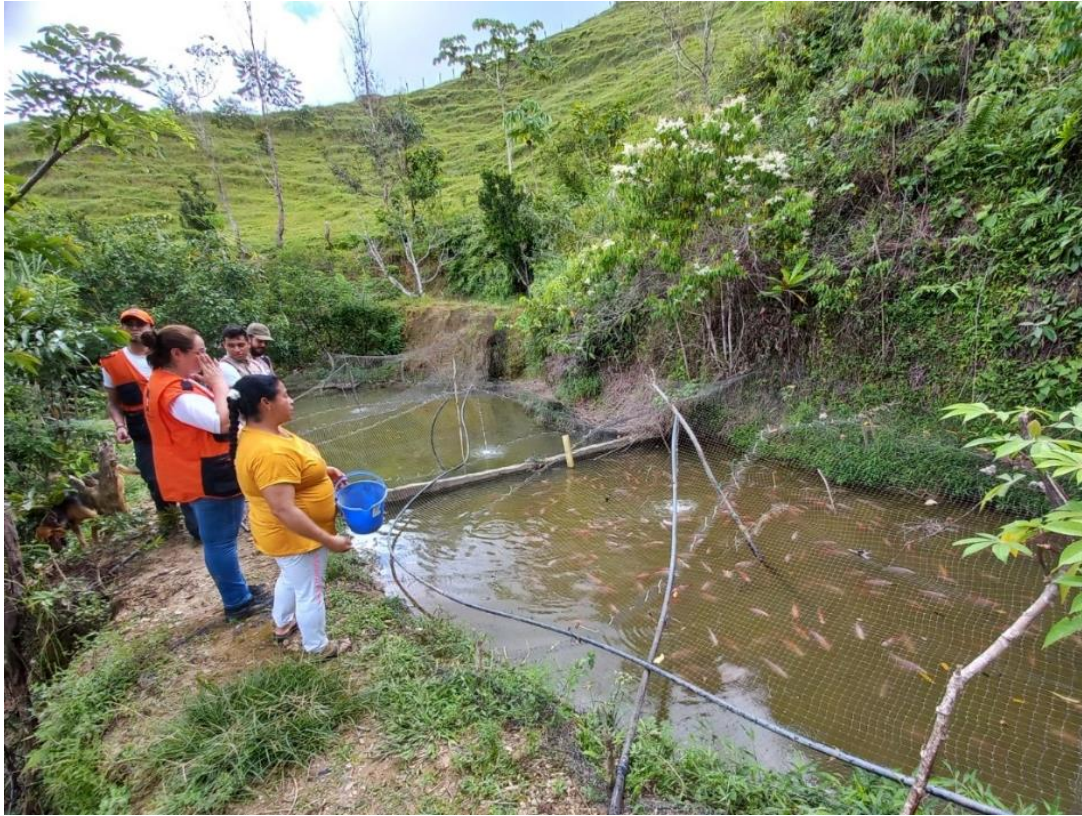
Fish farming in Madre Seca village, Anori, Colombia.