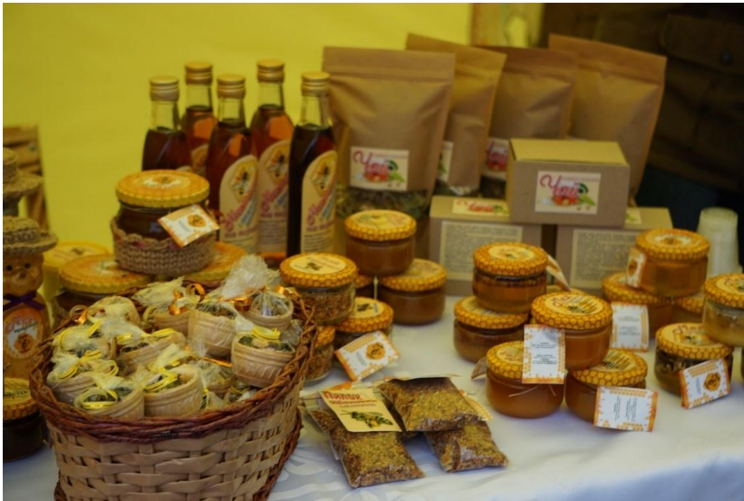
A honey fair in the Luhansk region of Ukraine.