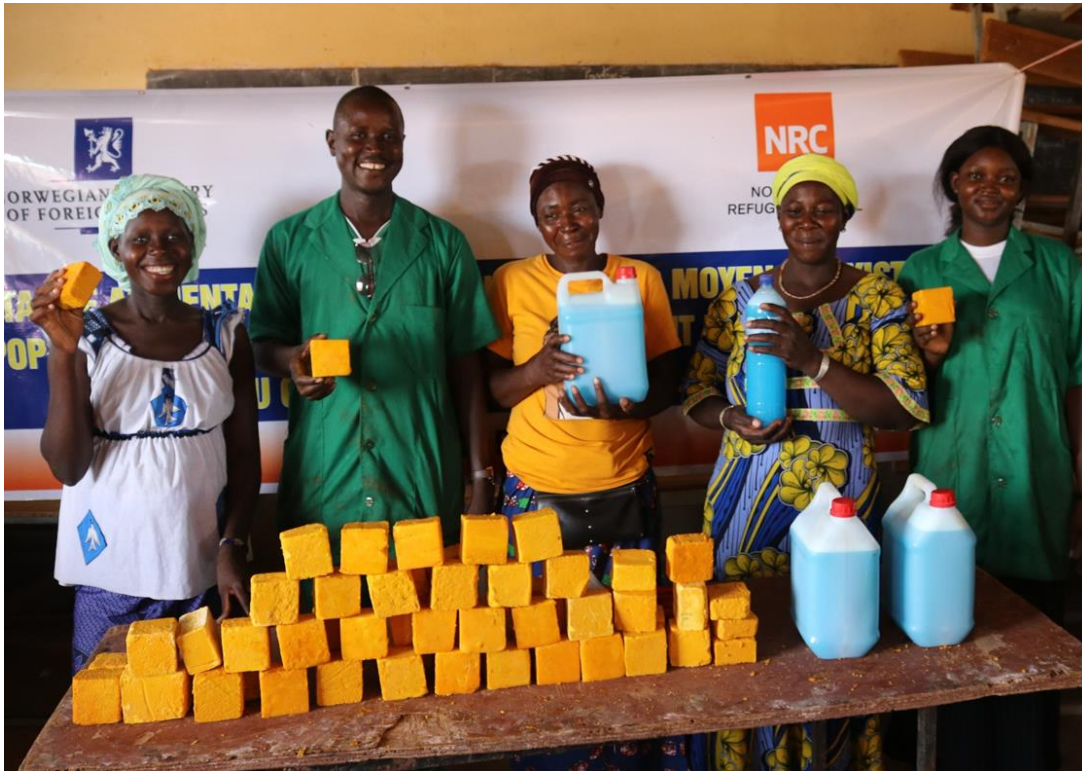
Soap production as a business, Burkina Faso.