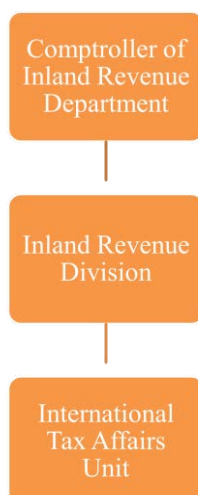
Figure 1. Competent Authority Organisational Structure