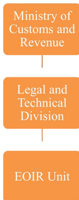
Figure 1. Competent Authority Organisational Structure