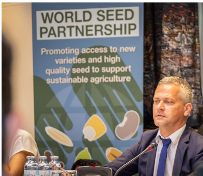
Programme Manager during the 2019 Annual Meeting of the OECD Seed Schemes

To find out more about how the partnership can help you, please consult the WSP website ( www.worldseedpartnership.org ) or send your enquiry to: info@worldseedpartnership.org