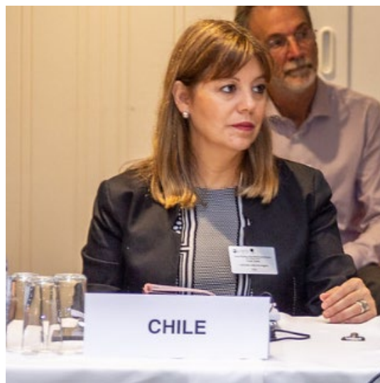
2019 Annual Meeting of the Seed Schemes held in Vienna, Austria

Chile was the first country from Latin America that joined the OECD Seed Schemes in 1972. The delegate from Chile took part in the 2019 Annual Meeting.