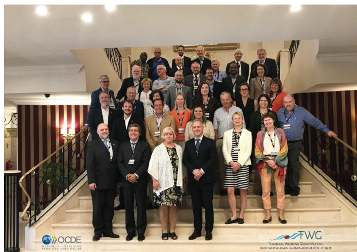
Family photo during the technical Working Group Meeting held in Argentina in January 2019

Chile is Member of OECD since 2010. The OECD Secretary-General was in Santiago