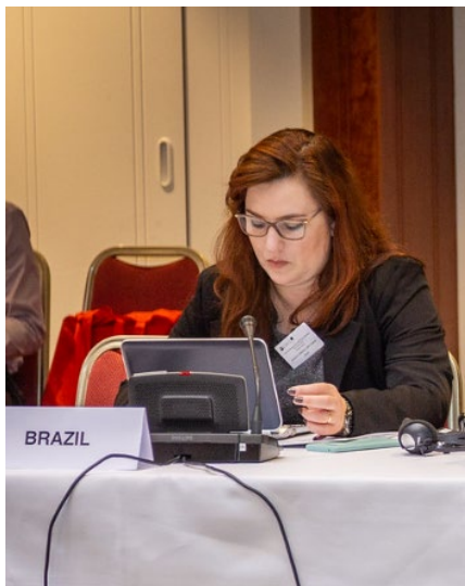
2019 Annual Meeting held in Vienna, Austria

After its admission to the OECD Seed Schemes in 1999, Brazil hosted the 2006 Annual Meeting of the Schemes in Fortaleza (State of Ceara) in August 2006. The country participates regularly in the OECD Technical and Annual Meetings.