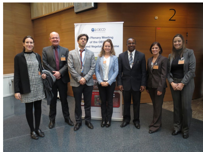
Kenya as Chair of the Bureau, with delegates from the Netherlands, Spain and OECD Secretariat for the admission of Brazil to the OECD Fruit and Vegetables Scheme in OECD in December 2017.

help to increase the dissemination of the work of the Fruit and Vegetables Scheme.